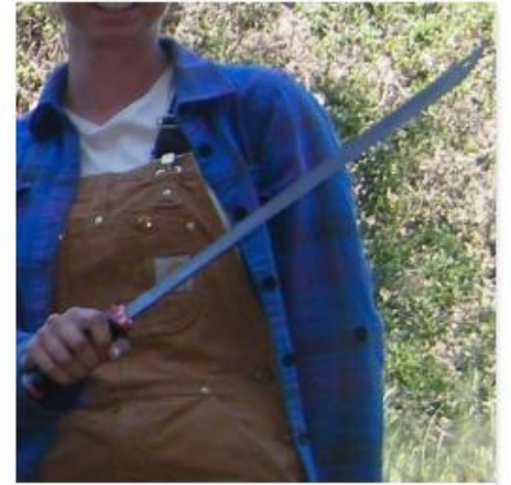
Cutting: Bladed Hand Tools