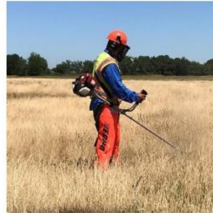
Cutting: String Trimmers / Brush Cutters