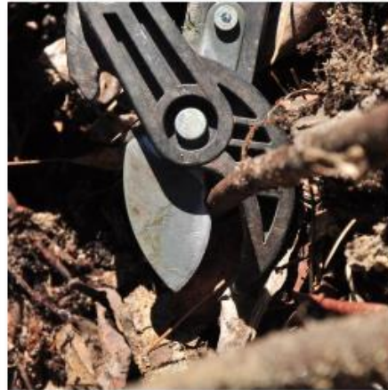
Cutting: Pruners, Loppers, Shears, and Hand Saws