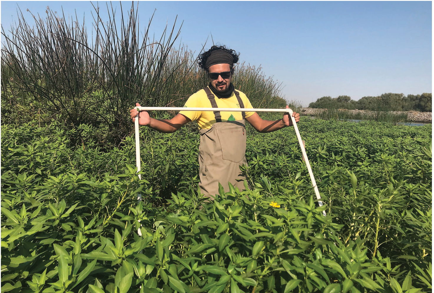
UC Davis postdoc measuring reinvasion rate of water primrose in previously treated experimental control plots at a restoration study site in the Delta.