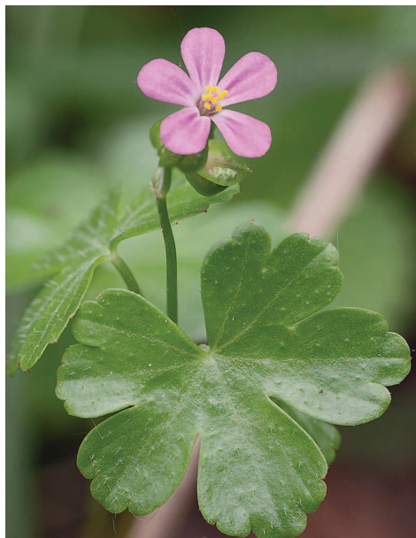
Geranium lucidum (shining geranium) flower and leaf detail.

Progress has been made in Del Norte County, where herbicide has been used to reduce the extent of the infestation by 30%. Whereas in Humboldt County, the infestation has more than doubled and is now found scattered over 100 miles of Highway 101. Despite the state funding starting in 2016 dedicated to eradicating regional priority weeds including Geranium lucidum , at this point the EDRR opportunity for eradication has most likely been lost.