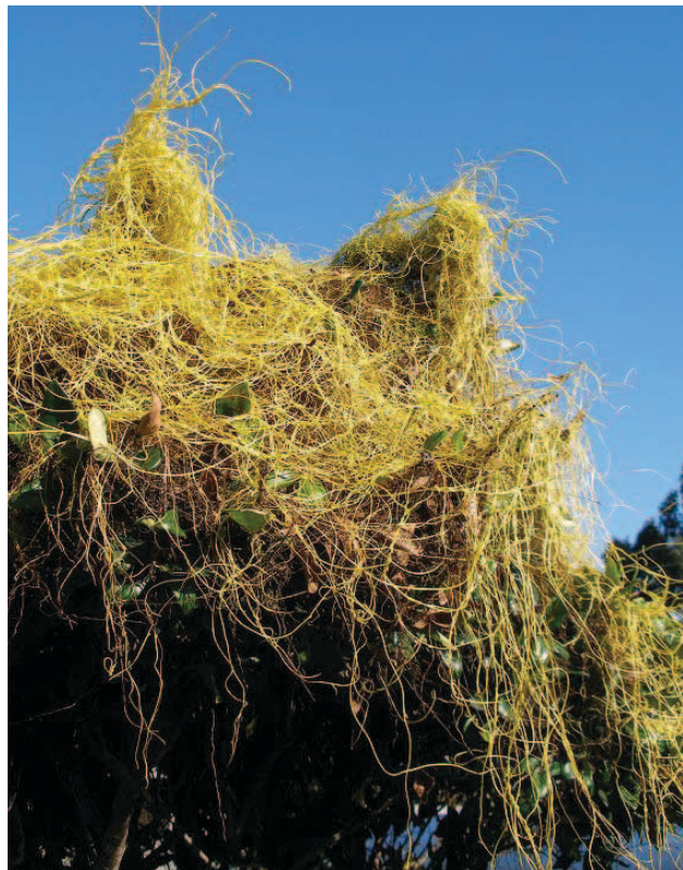
Japanese dodder (Cuscuta japonica) in Contra Costa County.

The sites of two unconfirmed herbarium records were visited in 2022 and new records entered into Calflora. There remain 43 unconfirmed herbarium records that have not been visited, accounting for 23% of the Bay Area EDRR populations.