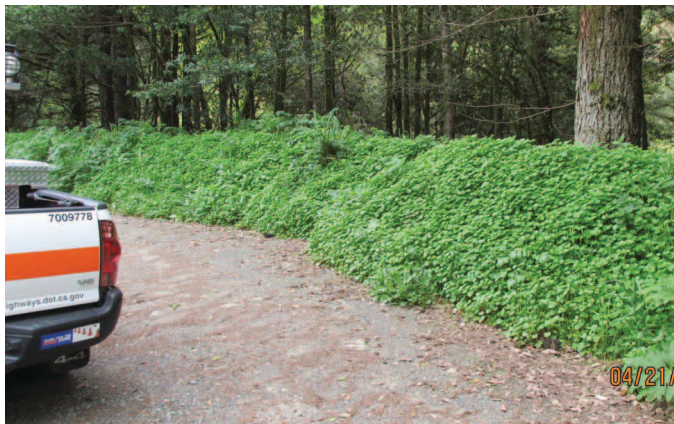
A roadside invasion of shining geranium in 2015.

Control of shining geranium can be difficult without herbicides. Deep mulching can work, where appropriate, though that is nonselective and kills all other plants, too. It is also not suitable or practical for many roadside sites and depends on availability of wood chips. However, Caltrans has long abstained from herbicide use on roadsides in Humboldt County based on an agreement with the county board of supervisors.