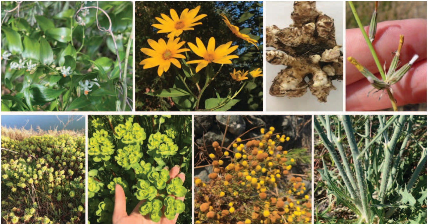
Clockwise from top left: Asparagus vine , Jerusalem artichoke flowers and large underground tubers, skeleton weed flower heads (top) and stalks (bottom), stinknet flowers, sunwort flowers, and sunwort plants. Photos: Skeleton weed flower heads © 2015 Neal Kramer, all others by Jennifer Mo.

In the Bay Area, creeks run right behind back yards, construction sites, golf courses, and office complexes. They provide important remnant habitat in urbanized areas. They are also home to a wide variety of weeds, and the availability of water and space makes them highly susceptible to new ones. In my work managing invasive plants for the Santa Clara Valley Water District, I routinely find new weeds with few or no records of occurrence in the area. None are having major impacts yet, but their presence and spread raises concerns for the future. Here are a few of my encounters with rare weeds, plus some tips on spotting them in the wild.