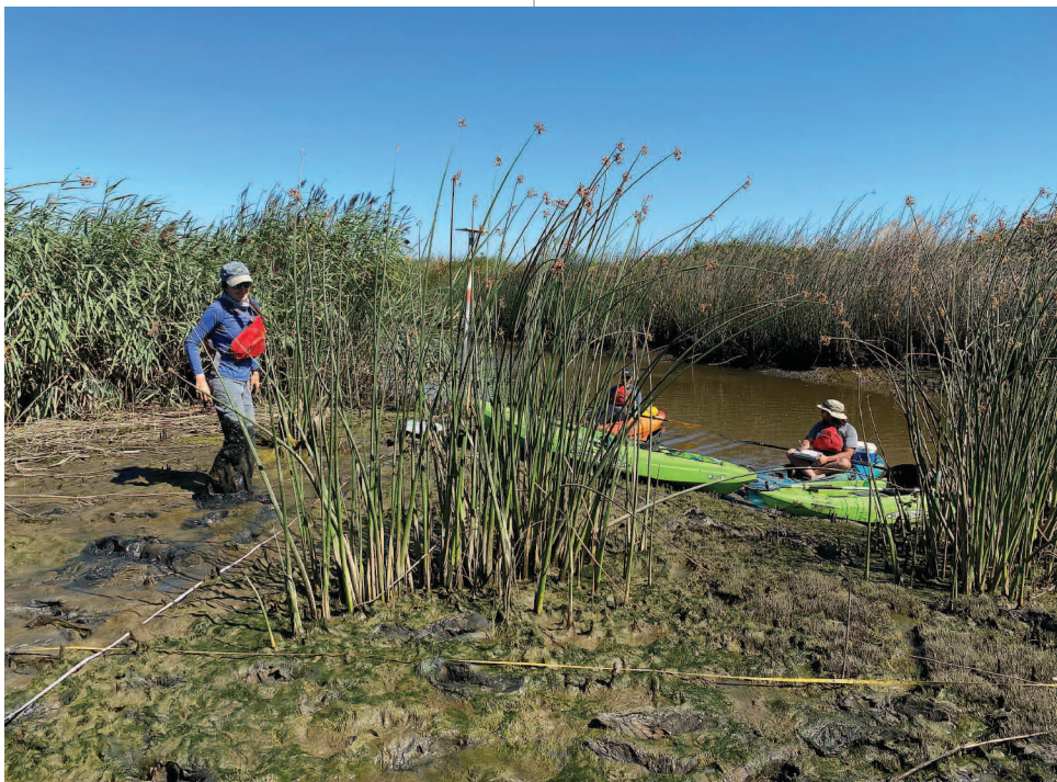
UC Davis postdoc measuring reinvasion rate of water primrose in previously treated experimental control plots at a restoration study site in the Delta.

Stay tuned for the date of the next biennial Delta Invasive Species Symposium later this year.