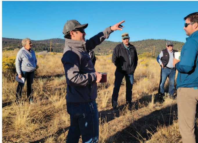
Members of the Oregon State Weed Board gather at the annual fall meeting.