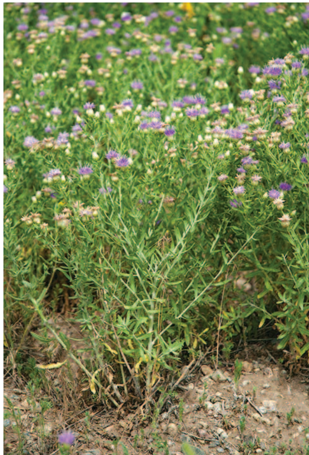
Russian knapweed (Rhaponticum repens) is the most widespread of the Bay Area EDRR species.

Herbarium records are unique in Calflora in that you cannot update their management status or include them as part of a history stack. To address this, we have encouraged Bay WMA partners to make new records when visiting unconfirmed herbarium records, so that these new records can have a management status and can become history stacks.