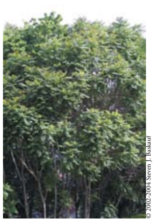
Tree-of-Heaven (Ailanthus developed to help gardeners altissima), at one time a popular street tree, has spread along the coast and through the Sierra foothills. It creates dense thickets that reduce or eliminate native vegetation and wildlife habitat.

This brochure was and landscape designers choose trees that work for their sites while protecting the health and beauty of the California landscape.