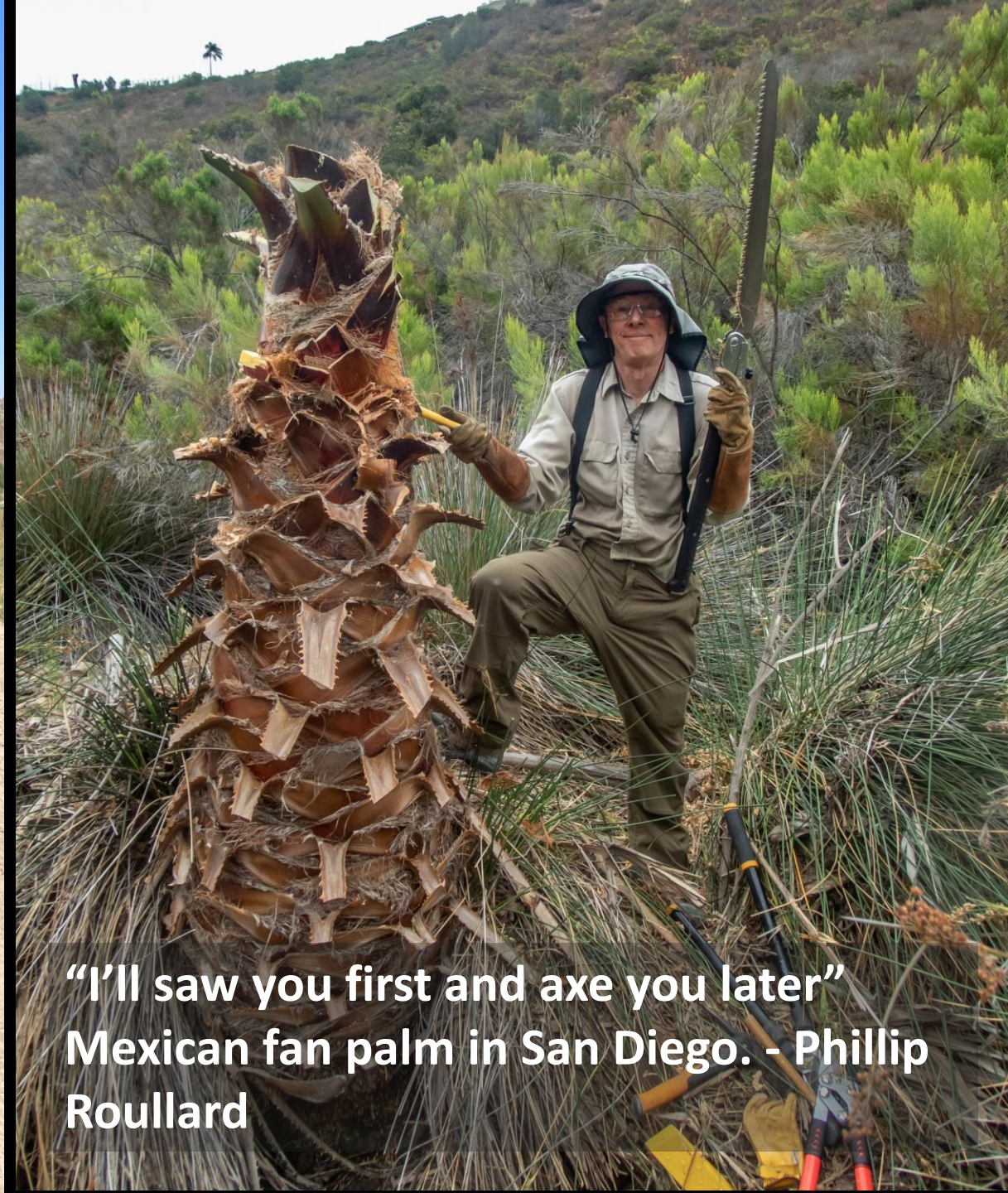
"I'll saw you first and axe you later" Mexican fan palm in San Diego.