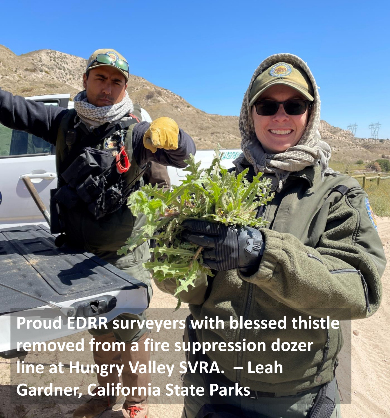
Proud EDRR surveyors with blessed thistle removed from a fire suppression dozer line at Hungry Valley SVRA.