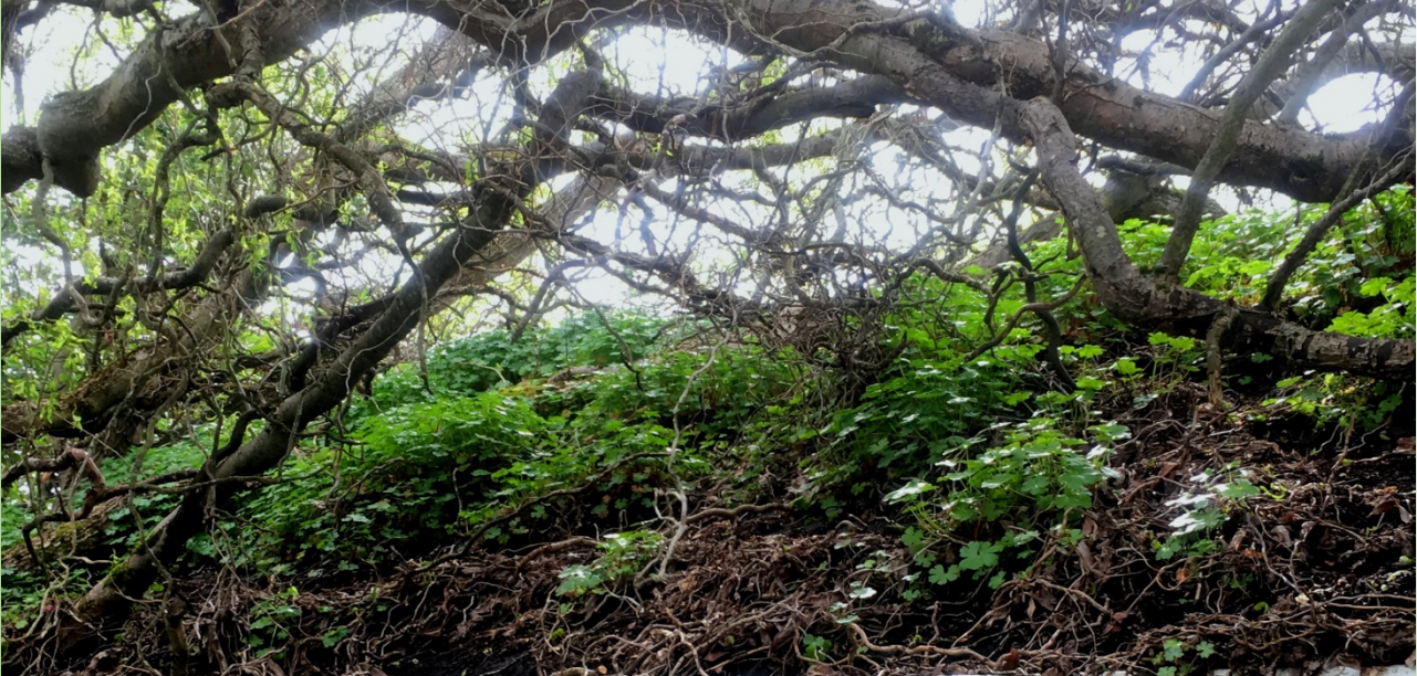
Roof Top Shiny Geranium 2016 Class B Noxious Weed