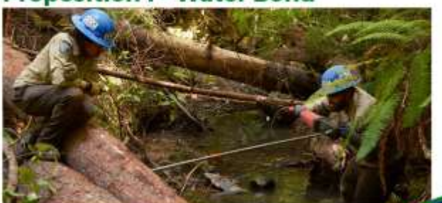
Proposition 1 - Water Bond