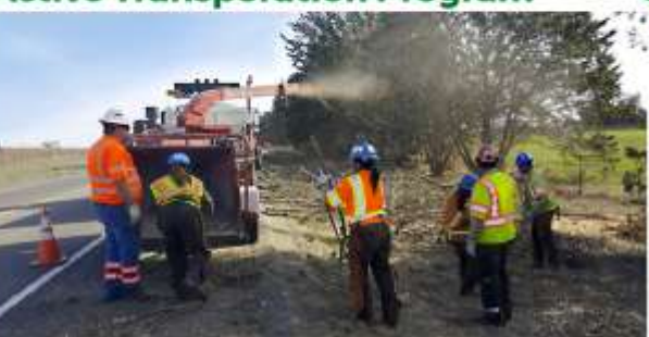
Active Transporation Program