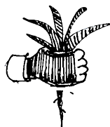
These cards were adapted from a design by National Park Service.