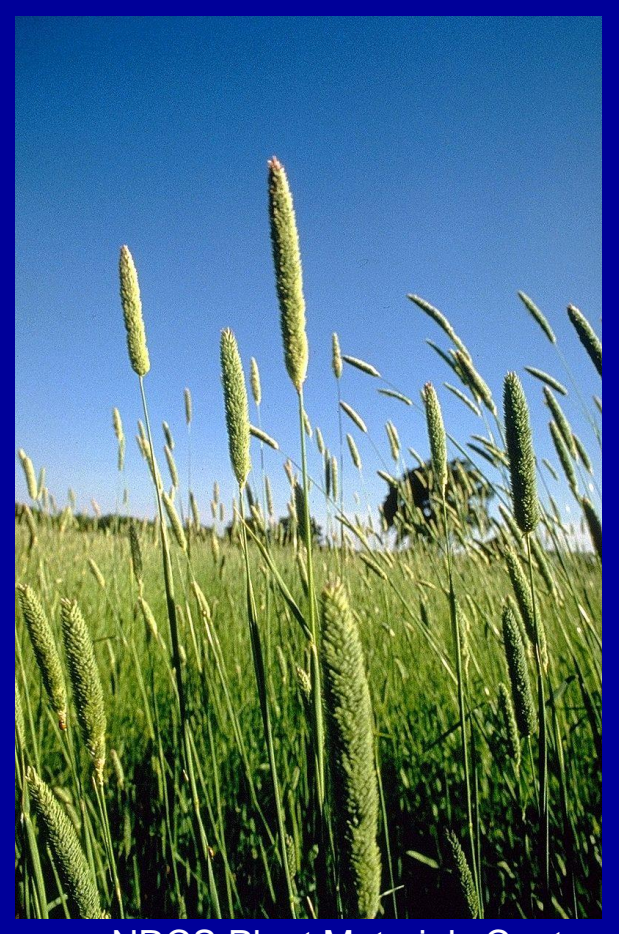
NRCS Plant Materials Center

Perennial bunch grass to 1.5 m Distributed by USDA Very similar to P. aquatica but w/ hairy glumes Often found nr where planted Thrives in grassland after removal of grazing Not a great forage