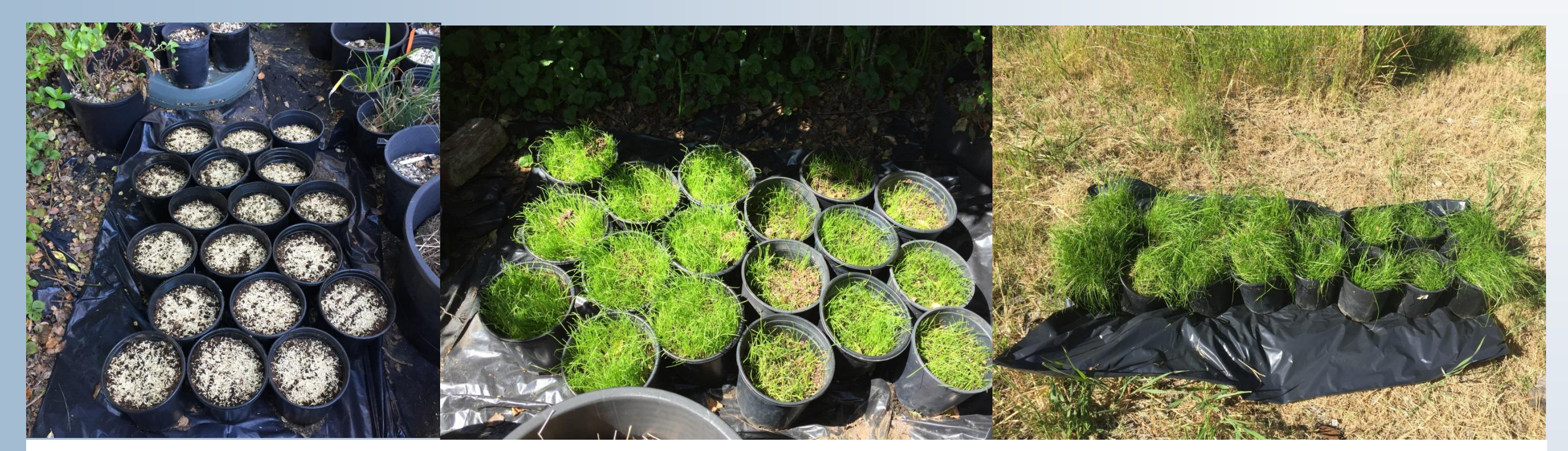
Figure 1. Allelopathy test conducted in spring 2017. In this test an annual ryegrass seed mixture was germinated in potting soil to which minced Oxalis pes-caprae foliage was added. This treatment was compared with control pots without oxalis. Left: pots filled with potting soil at the time of seeding on March 14. Center: control pots on left and treatment pots on right on March 28. Right: Control pots on left and treatment pots on right at the time of foliage on May 12.

Given this growing recognition of O. pes-caprae as a threat to natural areas, researchers in many parts of the world are trying to develop effective approaches to manage it (LeStrange et al. 2010). The present study is a preliminary test of the efficacy of several different herbicides and herbicide combinations for the management of Bermuda buttercup in wildland areas.