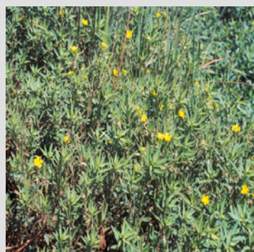
Ludwigia spp. Joe Di Tomaso