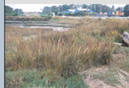
Spartina spp. Joe DiTomaso

The Invasive Spartina Project is a coordinated regional effort among local, state and federal organizations dedicated to preserving California's extraordinary coastal biological resources through the elimination of invasive species of Spartina (cordgrass). The highly effective synergy between the San Mateo County Mosquito Abatement District (SMCMAD) and regional Weed Management Areas can serve as a model for similar efforts elsewhere. (4 & 5)