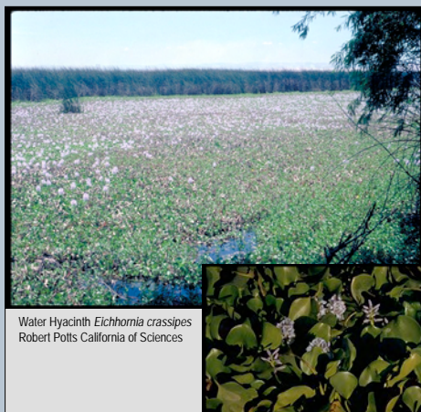
Water Hyacinth Eichhornia crassipes Robert Potts California of Sciences

Water Hyacinth, Eichhornia crassipes , Water Evening-primrose, Ludwigia spp. are among the principal problem plants. These invasives reduce circulation and inhibit predators. Water Evening-primrose infestations can be so dense that granules and briquettes cannot reach the water. Two studies presented at the 2008 MVCAC Conference showed reduction of predation by both introduced native fish (1) and mosquito fish (2).