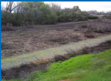
Start of Project 2004