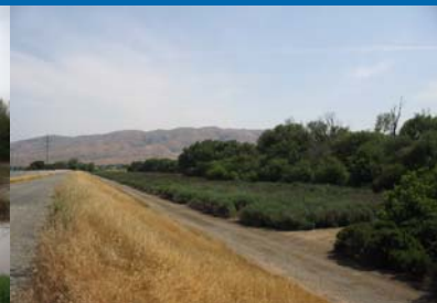
Floodplain Spring 2007