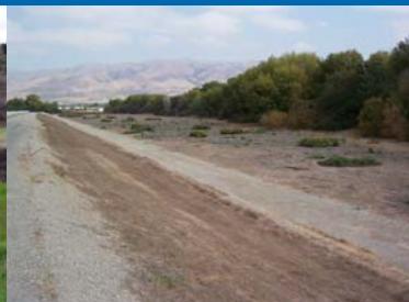
Initial Planting 2004