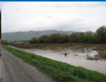
Project Flooded 2006