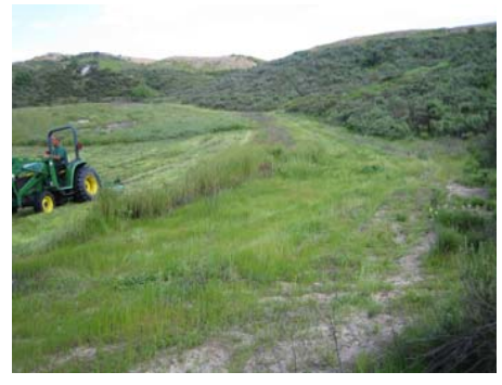
Figure 4. Mowing of treatment plot near RSS/NNG edge

Johnson-Roripaugh Ecological Preserve Figure 1. Aerial photograph of Johnson Ranch Ecological Preserve.