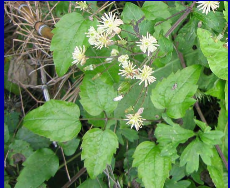
Kings County, WA

In CA known from Santa Cruz & Marin Counties