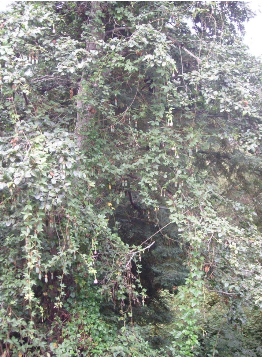
Banana poka [ Passiflora tarminiana (= P. mollissima )]