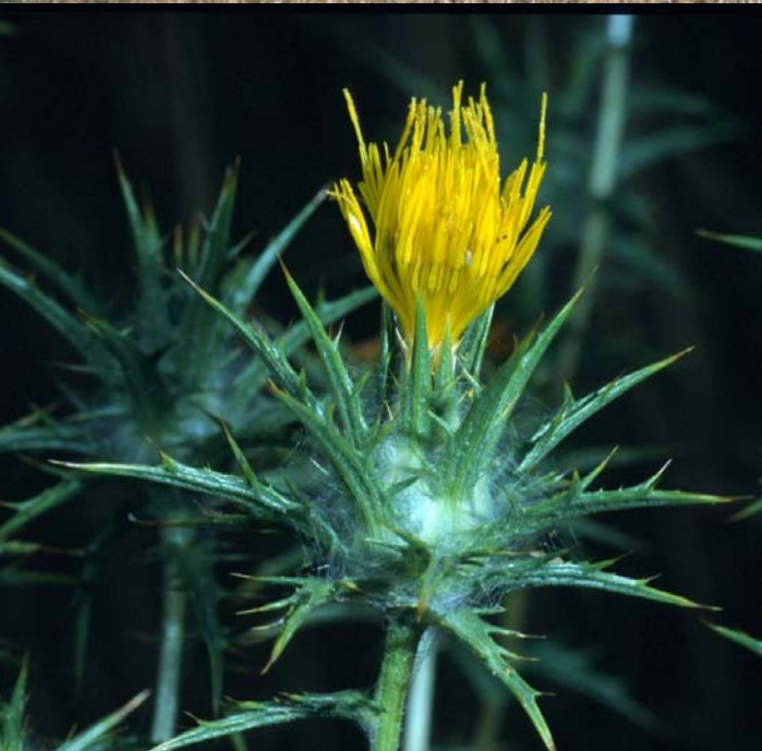
Woolly distaff thistle ( Carthamus lanatus )