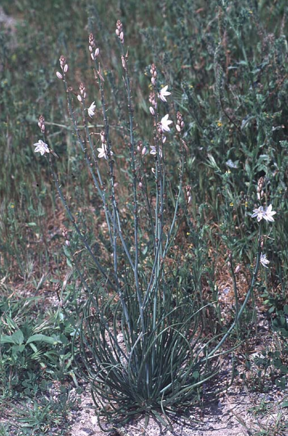
Onionweed ( Asphodelus fistulosus )