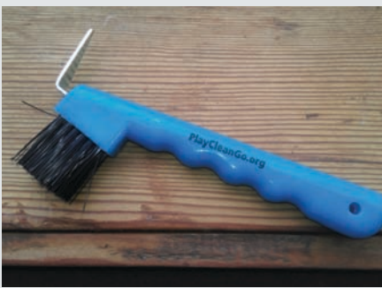
Cal-IPC now carries handy boot brushes to clean soil from your footwear. These are distributed by the PlayCleanGo recreational campaign to "stop invasive species in your tracks." $5 each, $40 for a pack of ten.

The Working Group for Phytophthoras in Native Habitats has developed a guide for minimizing soil contamination in restoration and sensitive sites to prevent the spread of Sudden Oak Death and other diseases caused by soil-borne pathogens. The practices described in the guide are useful for preventing the spread of invasive plant seeds as well, since these can be spread on boots. Land managers, volunteers and hikers should follow boot hygiene protocol when moving between sites. Preventive steps can minimize the risk of spreading damaging soil-borne pathogens and invasive plants.