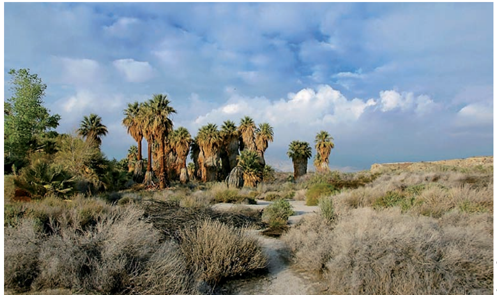
Palm oasis in Coachella Valley, CA