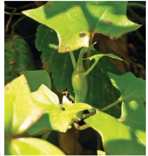
First galled shoot tip observed in the field in California, November 2016, at a site in Sonoma County.

In 2013, an application for a permit to release the fly was submitted to the USDA-Animal and Plant Health Inspection Service (USDA-APHIS), and was subjected to peer review by a panel of experts from the U.S., Canada, and Mexico. The panel recommended release of the fly. Subsequently, a Biological Assessment was prepared, which received concurrence from the U.S. Fish and Wildlife Service, and an Environmental Assessment was pre-