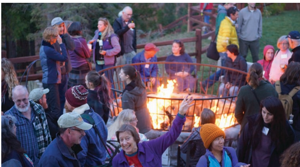
Evening socializing around the campfire at Tenaya Lodge during Cal-IPC's 2016 Symposium.