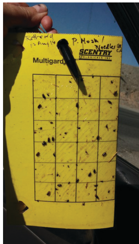
Sticky trap with male-derived aggregation pheromone for Diorhabda . These sentinel traps are broadly distributed to detect colonization as the beetles move into new regions. The pheromone, which is produced at our UCSB lab, is also used to retain beetle populations at the site where they are released.

With the beetles now naturally moving into California, it is important to quickly re-establish a comprehensive monitoring program. The Alliance can provide guidance on sensitive sites, such as those within SWFL nesting territories, and planning resources for restoration where necessary ahead of the beetles' movement.