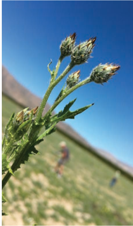
Volutaria flower heads.

Volutaria is a winter annual in the sunflower family and is closely related to knapweeds and starthistles. It germinates after winter rains and blooms from February to April. The urn-shaped inflorescence has phyllaries that are spine