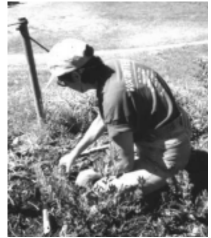
Volunteer participating in a Sausal Creek workday.

Contact the author at kpaulsell@pacbell.net .