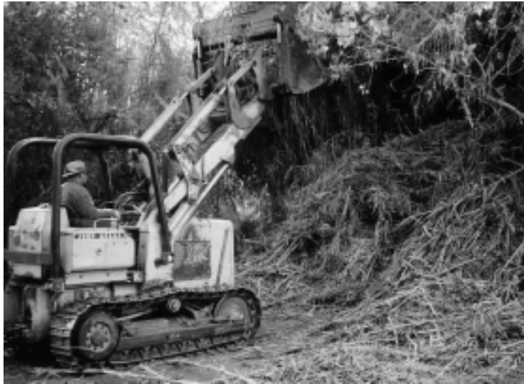
Removing Arundo on the San Diego River.

ignoring other species waiting in the wings to fill their niche once we eradicate the most dominant species.