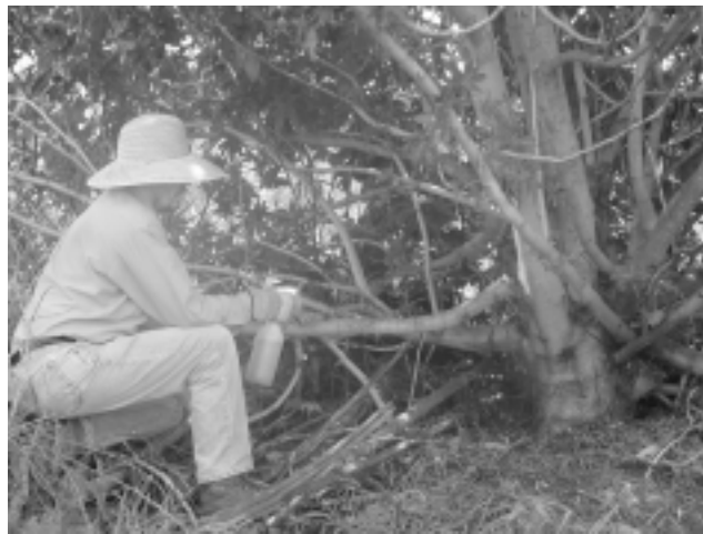
In the basal-bark treatment method , applicator sprays lowest 12 to 15 inches of bark around trunk and lower branches. Using Pathfinder II herbicide, this 16-inch-diameter castor bean trunk was treated in 40 seconds at Sepulveda Dam Basin in San Fernando Valley.

After herbicide treatment, dead trees left standing will topple within one year and disintegrate to wood fragments over several years. Some practitioners cut off and bag the seed clusters for disposal, but I never do. Green unripe seeds should be incapacitated by the herbicide treatment, and in any case, a persistently viable seedbank will already be present on the ground under and near the tree canopy from prior years of seed production. Another advantage of basal bark treatments, compared to foliar spraying of established large plants, is that the herbicide is applied beneath the castor bean foliage, without risk of drift to adjacent native vegetation.