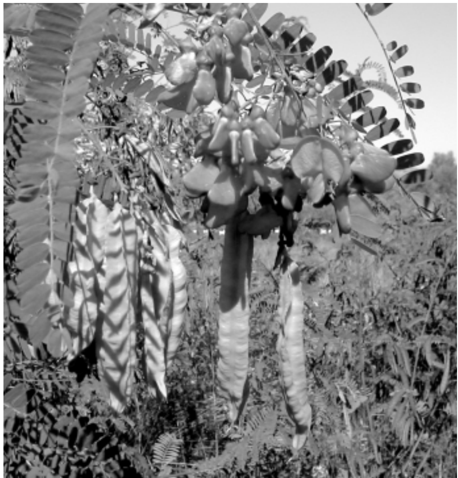
The large winged pods of red sesbania can float for miles before lodging and starting a new infestation.

To control red sesbania, biological, chemical, and mechanical treatments have all been used successfully. In South Africa, a combination of three insects from Argentina has provided effective biological control of red sesbania (Hoffmann and Moran 1998). The sesbania flower beetle ( Trichapion latrivetre ) can reduce pod production by up to 98%, though its effectiveness depends on climate. The sesbania seed weevil ( Rhysomatus marginatus ) reduces