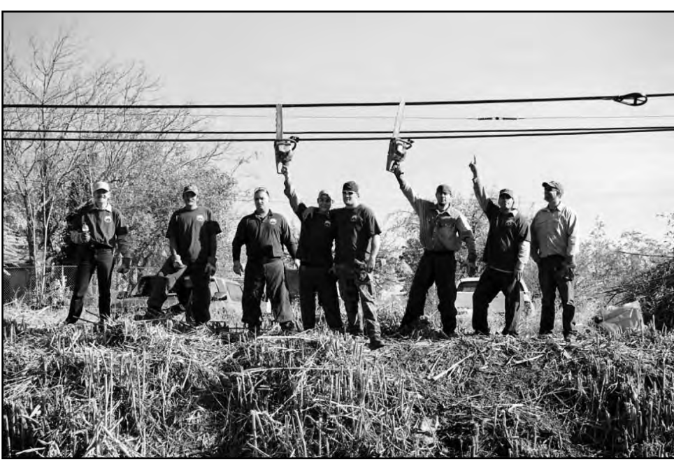
Volunteers with the Stream Team from Redding's Good News Rescue Mission show off their favorite Arundo control tools.