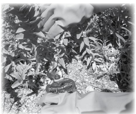
Hold the clippers with the flat surface facing downward to maximize the amount of herbicide applied to the cut stem.