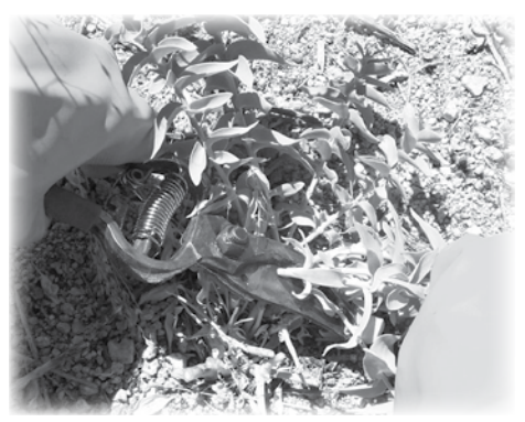
2. Clip plants as close to the soil surface as possible. Avoid touching the blades to the soil.