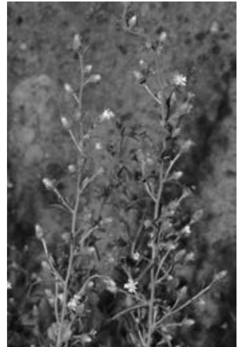
Dittrichia graveolens .

This Asteraceae species sets mature seed very quickly after bloom, so dealing with it pre-bloom is almost a necessity. In both 2011 and 2012, the Ag Dept. spent over 200 man-hours/year on stinkwort. This represents a significant commitment and demonstrates how serious we are about