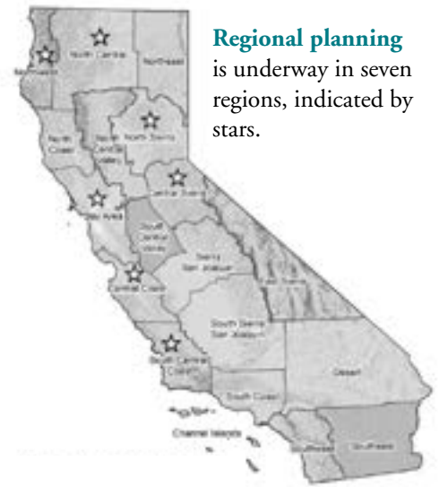
Regional planning is underway in seven regions, indicated by stars.

When all populations of important invasive plants in an area have been mapped, the WHIPPET tool developed by Gina Darin and collaborators at UC Davis can be used to set finer-scale priorities between populations of multiple species. With support from the US Fish & Wildlife Service and the USDA