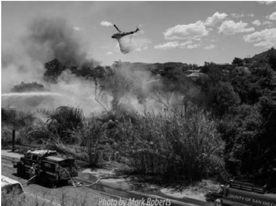
San Diego arundo fire started in a homeless encampment. The Mother’s Day fire destroyed or damaged five structures and a woman was hospitalized in critical condition.

Vector risk assessments for aquatic invasive species completed for California. The state’s Ocean Science Trust commissioned studies to help address pathways of introduction and spread. calost.org/science-initiatives/?page=aquatic-invasive-species