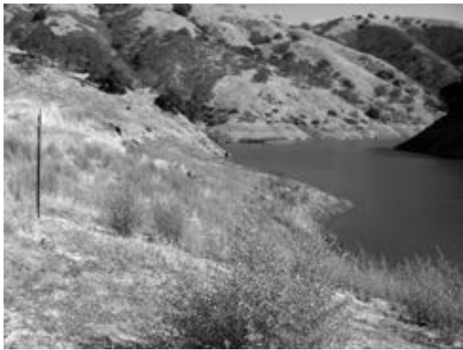
Stinkwort around a reservoir in Santa Clara County.

In October 2010, the Mendocino County Department of Agriculture was notified by a local weed warrior and member of the Inland Mendocino County WMA that they had found a significant stinkwort ( Dittrichia graveolens ) infestation near Willits. This was our first indication that stinkwort had arrived in the county. We surveyed the immediate area and mobilized the next day to hand-pull all the plants, enough to fill 34 garbage bags.