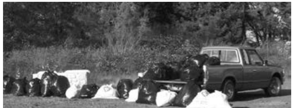
Bags of removed stinkwort removed as part of “rapid response” effort in Mendocino County.

Contact the author at morsec@co.mendocino.ca.us . California Agriculture published an article on the expansion of stinkwort in its April-June 2013 issue, available at californiaagriculture.ucanr.org/archive.cfm .