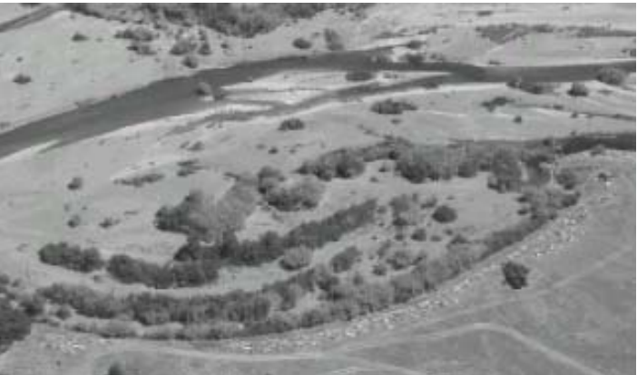
From the air The remote sensing techniques was used at a site along the Sacramento River (lower photo). Arundo was detected from a characteristic "signature" in aerial photos using 6 frequency bands. The blue areas in the upper photo mark patches of Arundo as determined by the classification software.