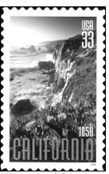
150 years... of Carpobrotus

January 14-16, 2003 Sacramento Convention Center, CA <a href="www.iep.ca.gov/calfed/sciconf/2003/">www.iep.ca.gov/calfed/sciconf/2003/</a>