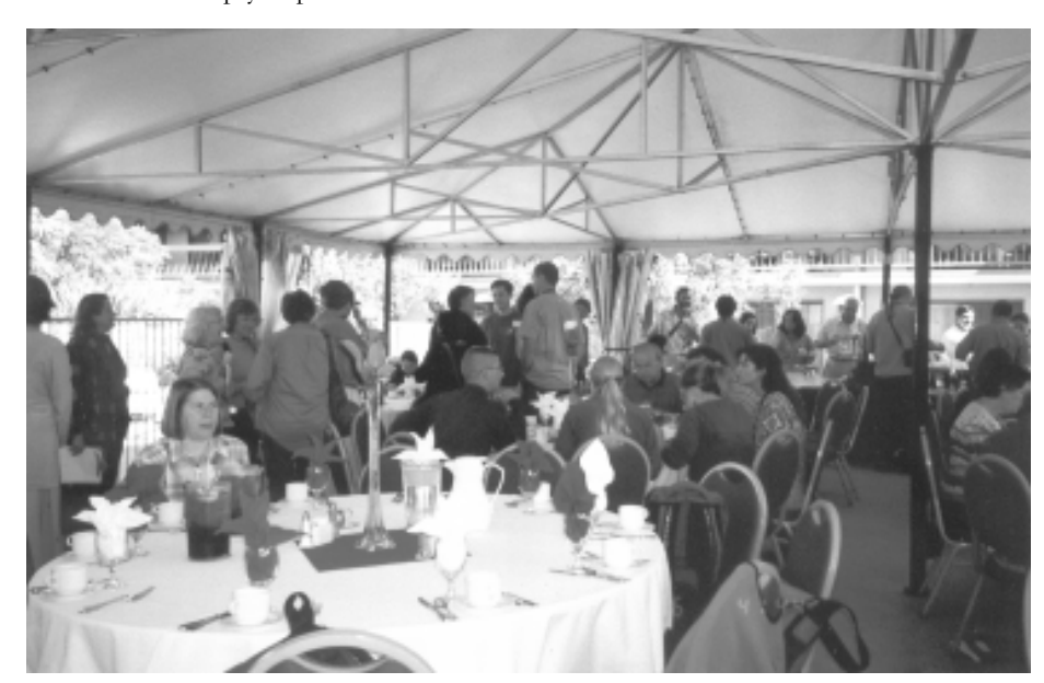
Bringing people together under a big tent Lunch outside at the 2002 Symposium in Sacramento, October 11-13.

We also present some interesting early results from a remote sensing project that is enabling inventory of Arundo over large areas from aerial imagery. And speaking of Arundo, we hear from the questionable ideas department that the SamoaPacific mill on Humboldt Bay is proposing to grow Arundo agriculturally as a source of pulp for paper. It might slow down the logging on our forests, but the potential to spread rhizomes is frightening. Perhaps they could use the mill to process eucalyptus pulp instead! We'll keep you posted.