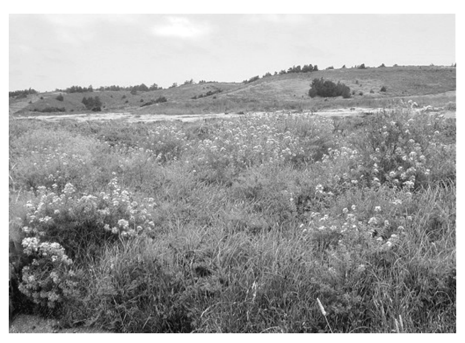
H. canariense infestation on the San Mateo County coast along Highway 1.