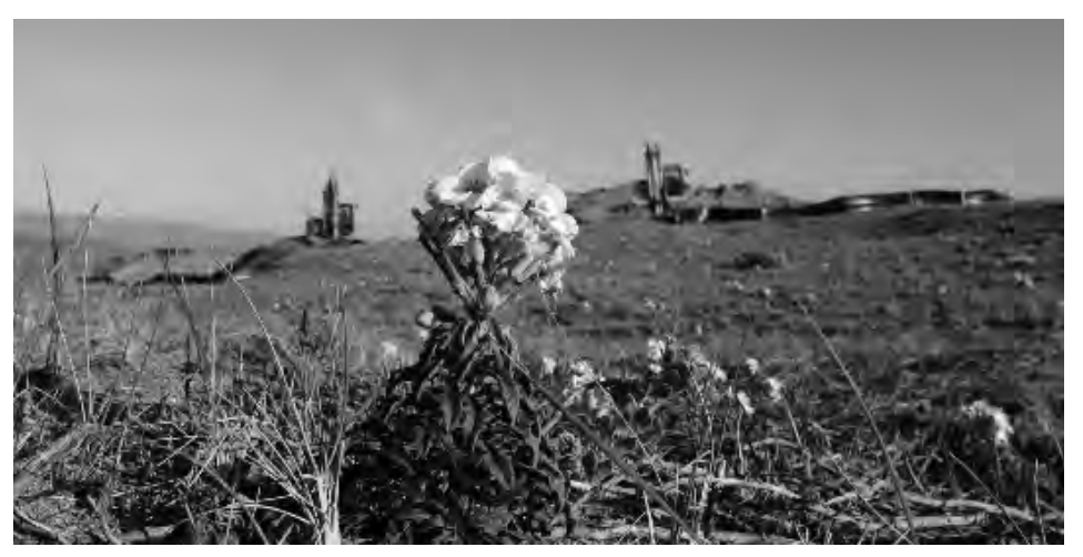
Seaside wallflower ( Erysimum concinnum ), a CNPS-listed rare plant, with construction equipment in the background.

Ultimately, it's too soon yet to make a prognosis on the long-term success of this project. So many factors can affect success, and many of them are completely external to the restoration process, including short-term and long-term weather patterns and regional trends in plover abundance and population health. However, park staff are certainly delighted with preliminary results of this project and hope to build on its seeming success