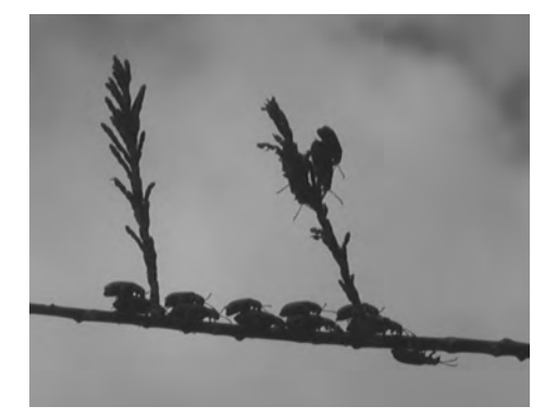
Beetles climbing along a tamarisk branch.

The tamarisk leaf beetle has not been introduced to the Gila River watershed of southern Arizona, out of concern over the impact on endangered birds that nest in tamarisk, including the Southwestern Willow Flycatcher and