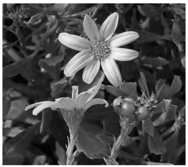
Spotting Bitou bush ( Chrysanthemoides moniflifera ssp. moniifera . Only the second population known in the state, found near the mouth of Aliso Creek in Orange County by Ron Vanderhoff, Orange County Chapter of CNPS. The plant is native to South Africa, and has become invasive in Australia and New Zealand.