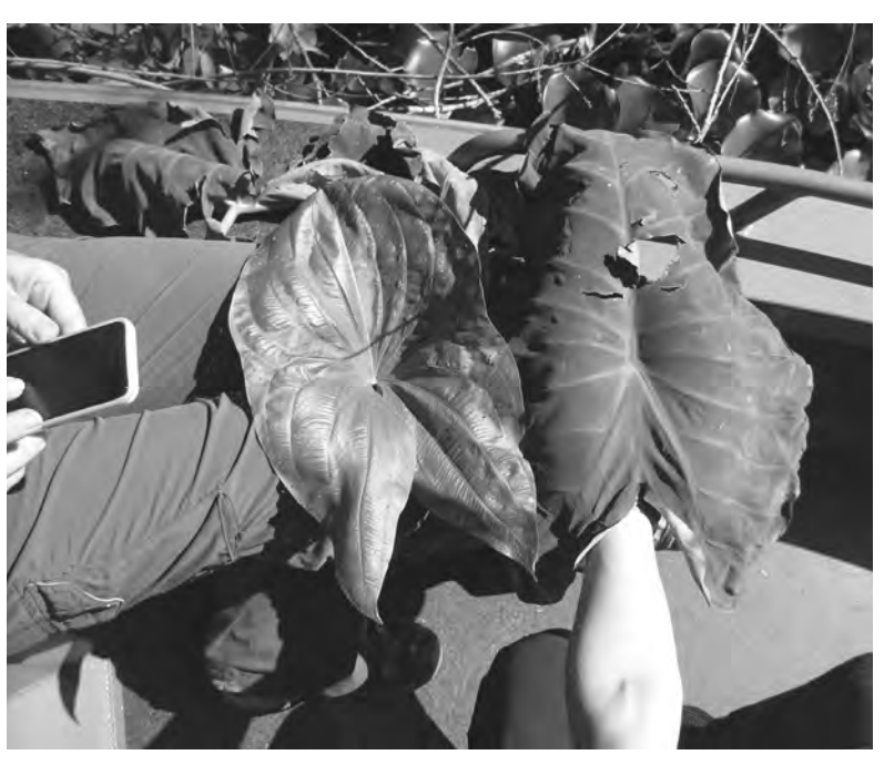
Taro root (on right) can be confused with the native arrowroot ( Sagittaria spp., on left). Below, taro root at Delta Meadows.

The coordination group met twice in 2014 and plans quarterly meetings in 2015. To date the group has discussed objectives of this coordination effort which include: strategic planning, education and outreach, funding, research and data management. The group's current