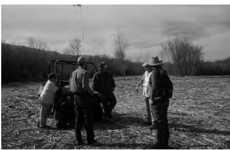
Dense Arundo donax stands in the Salinas River (above) and stream land management crew confering next to the arundo mower with widespread mulched arund canes (below).

to initiate and represented two separate but complimentary programs. The first program, led by the RCD, is based on what is becoming a standard approach for watershed-based Arundo control: develop a watershed-scale plan, and then get programmatic permits to start work at the top and work your way down. A number of programs in other watersheds (San Luis Rey, Santa Margarita, Santa