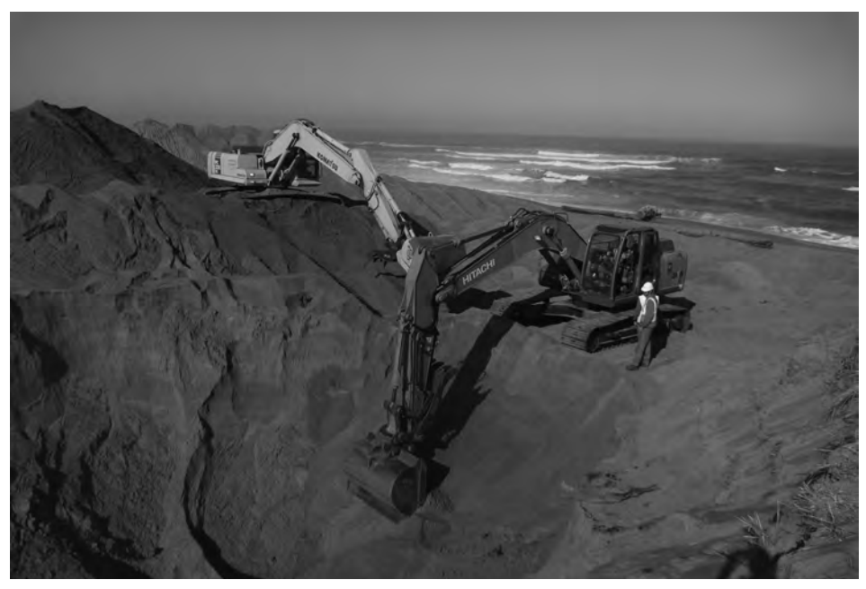
Biggest sand toys ever. Excavators were used to remove rhizomes and to bury sand contaminated with rhizomes deeply enough that it could not regenerate.

These species were already at Point Reyes when the Seashore was established in 1963. But it wasn't until the park developed its first large-scale vegetation map in the 1990s that the park recognized the extent of the problem. By that time, areas dominated by European beachgrass and iceplant accounted for more than 60% of the 2,200 acres of coastal dune, bluff, and scrub in the Seashore (NPS 2009). The continued encroachment of these species not only resulted ultimately in dense monocultures that supported fewer native dune plant species, but it had potential repercussions on other species as well, including the federally endangered Myrtle's silverspot butterfly (Speyeria zerene myrtleae) that feeds on the nectar on many dune plants and the federally threatened Western snowy plover (Charadrinus alexandrinus nivosus) that nests in unvegetated shorelines along the foredunes. Beachgrass can creep out into foreshore areas, and it provides cover for potential predators of eggs, chicks, and adults. In addition, beachgrass indirectly impacted endangered dune plants such as Tidestrom's lupine (Lupinus tidestromii)