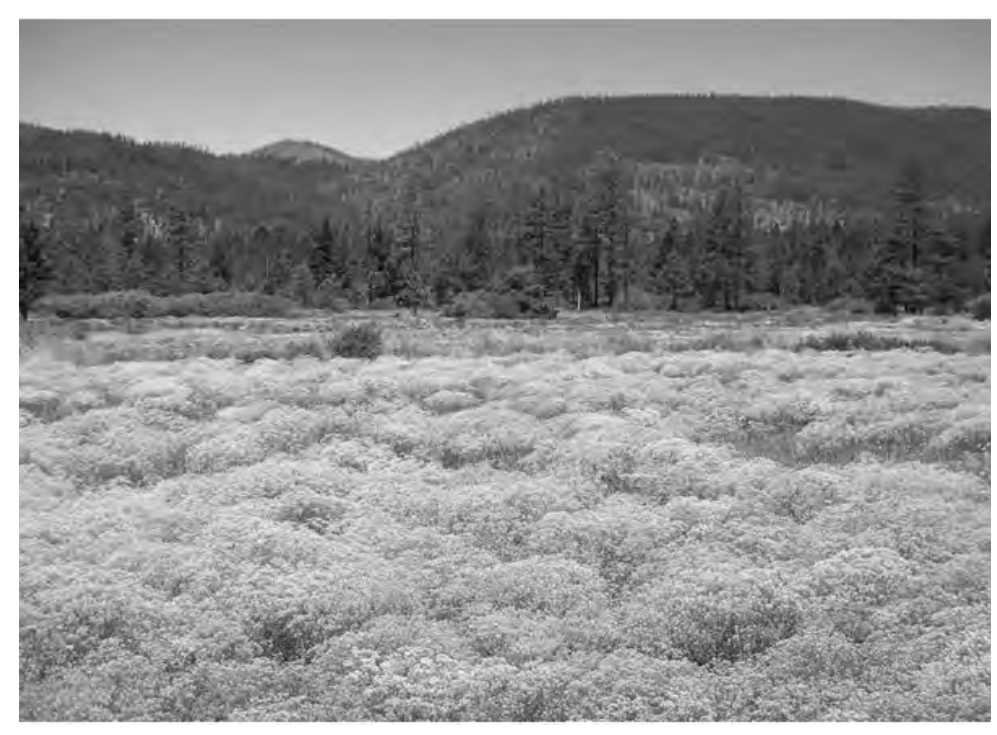
Alyssum species (A. murale and A. corsicum) are the light-colored (actually bright yellow) plants in the foreground, near Cave Junction in 2008 prior to initiation of the eradication campaign. The Oregon State Weed Board listed the species as A-rated weeds in 2009.

At California's northern border, Cal-IPC has been working with the Siskiyou