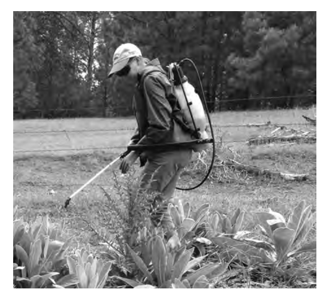
Controlling Scotch thistle in Calaveras County.

Work to eradicate incipient weed populations such as this one is funded by Cal-IPC through a grant from the National Fish and Wildlife Foundation. Scotch thistle has become a major weed in northeast California.