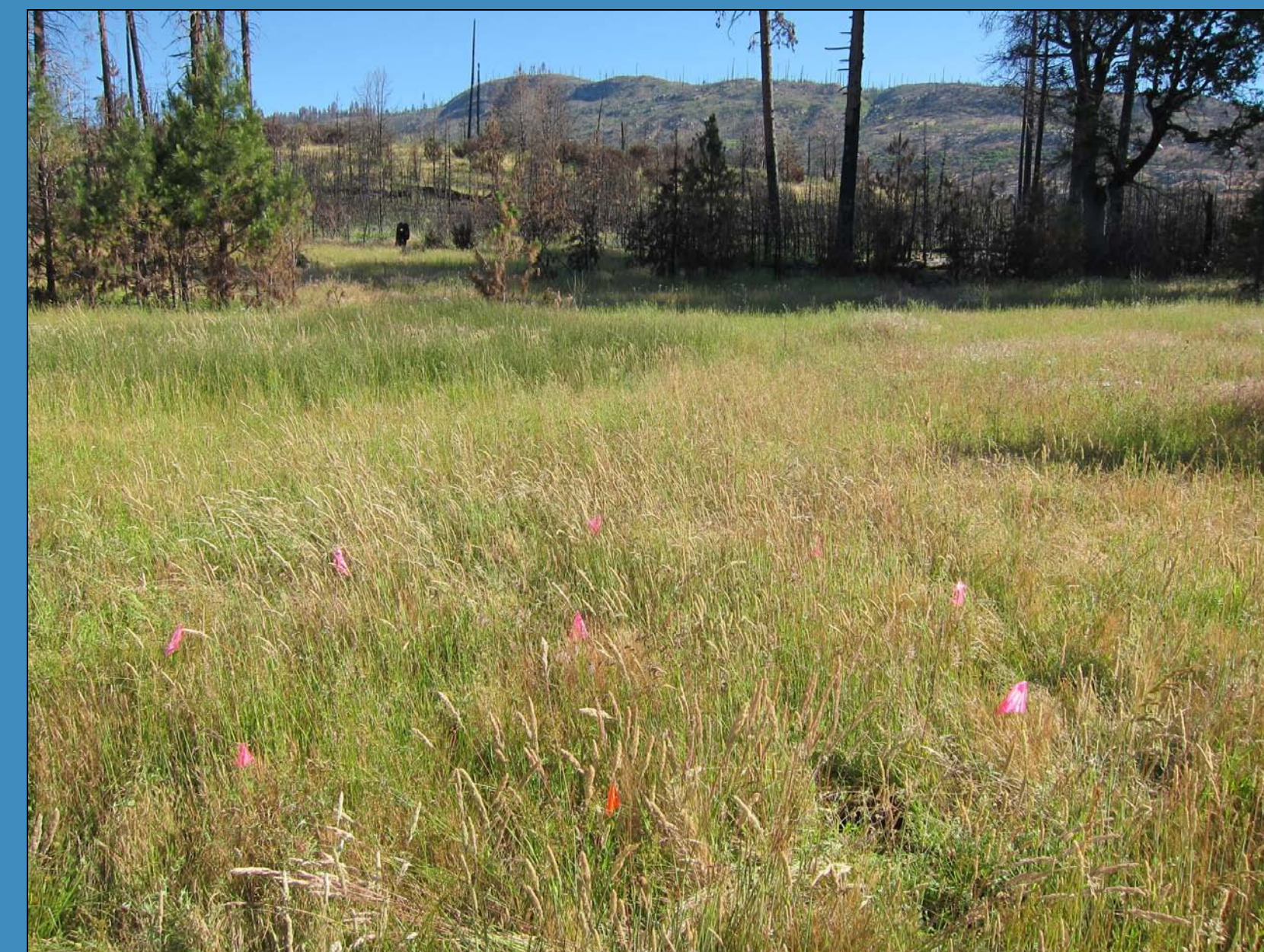
Documented distribution of common velvet grass in the park (left). A study plot placed in Big Meadow (right). Velvet grass has occupied a large portion of this and other meadows in Yosemite.