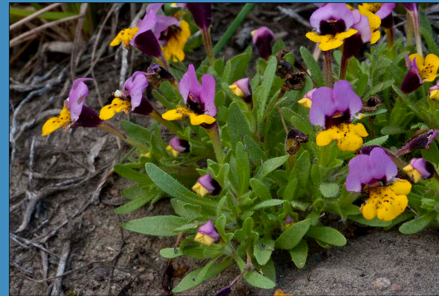
Velvet grass in Big Meadow towers over the rare yellow-lip pansy monkeyflower ( Mimulus pulchellus ). The pansy monkey flower is a Yosemite National Park special status species. It is also listed by the California Native Plant Society as category 1B.2: “plants rare, threatened or endangered in California with a moderate immediacy of threat.” It is endemic to California State, found only in three Sierra Nevada counties (Calaveras, Mariposa, Tuolumne).