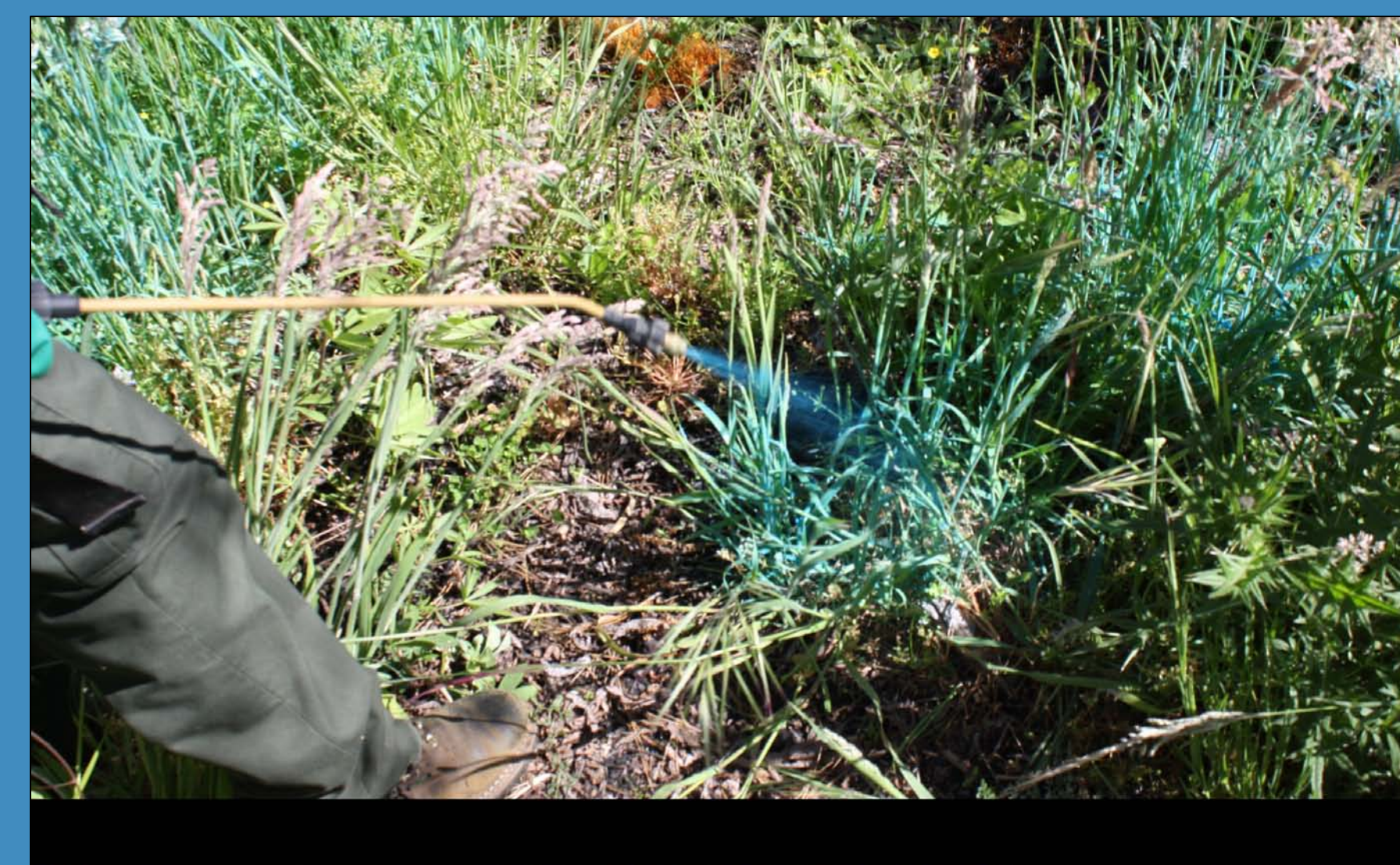
Daniel Bracken spot-sprays velvet grass with a 2% glyphosate solution. Blue indicator dye helps show where the herbicide has been applied.

A solution of only 0.5% Agridex surfactant applied to velvet grass shows that this standard concentration is far too low. Because the foliage is covered with velvety hairs, a 2% surfactant solution is needed.