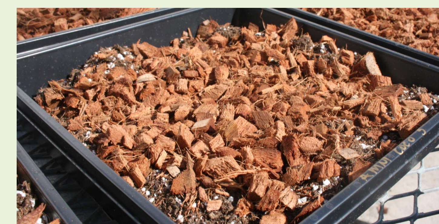
Coconut Shells (Control Non-Allelopathic)