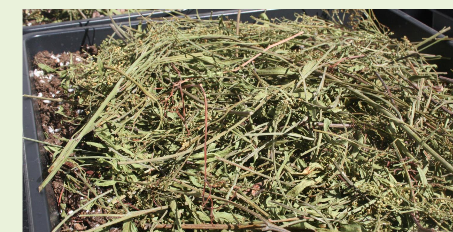
Male Leaves and Flowers