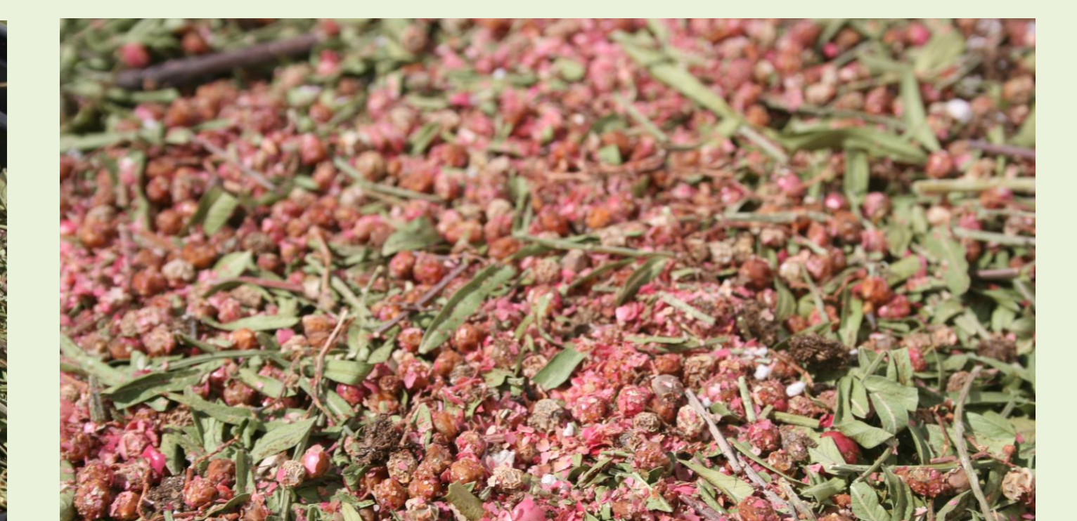
Female Leaves and Crushed Fruits

Mulch Experiment: To investigate the impacts of leaf litter from both genders, two mulch types from each gender were applied in 25 cm flats and seeded with 20 seeds from three native and three invasive species. Each species will have 5 replicates and will receive 60 grams of each mulch type and one control with no mulch.