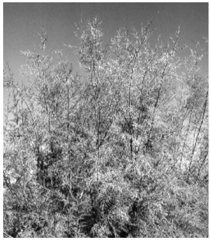
Saltcedar (Tamarix ramosissima)

he Saltcedar Management Workshop, held June 12, 1996 at the Marriott Rancho Las Palmas Resort in Rancho Mirage, was a huge success, attracting more than 150 people from 10 western states. Nine federal agencies were represented, along with four Native American tribes, four state agencies from California and Arizona, numerous local government entities, private consultants, pest control advisors, landscape and nursery businesses, three NGO's (nongovernmental organizations), and three universities. The subject of saltcedar was covered from beginning to end, with descriptions of its history, biology, and successful control tactics and projects elucidated by experts over the course of the day. The extent and severity of the saltcedar problem in the western US is apparent by the interest shown in this workshop. This workshop was co-sponsored by CalEPPC and the University of California Cooperative Extension offices in Imperial County and UC Davis Weed Science.