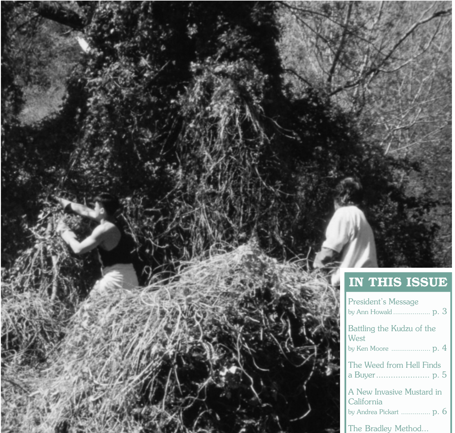
Wildlands Restoration Team volunteers tackle a wall of cape ivy on Waddell Creek, Big Basin State Park, Santa Cruz County.