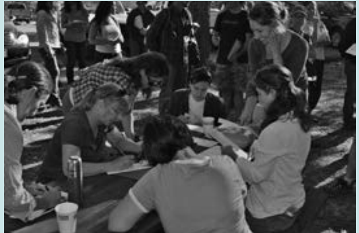
Learn from instructors (and attendees!)