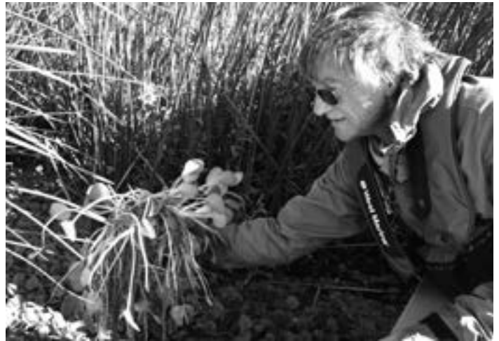
Spongeplant is now listed. The aquatic weed joins water hyacinth and Brazilian waterweed in the Delta.

Therefore, we recently updated Section 4500 to include these weed species (see below for added species, and www.cdffa.ca.gov/plant/IPC/encyclo-weedia/weedinfo/winfo_table-sciname.html for the complete list).