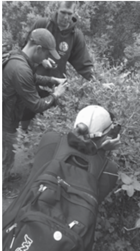
Taking data in the field with Observer Pro, part of the Weed Manager suite of applications.

Weed Manager is set up to track weed infestations and treatments over time. Each treatment record can be entered into a “history stack” for a given population. You can even re-draw polygons around an infestation each year as it's treated