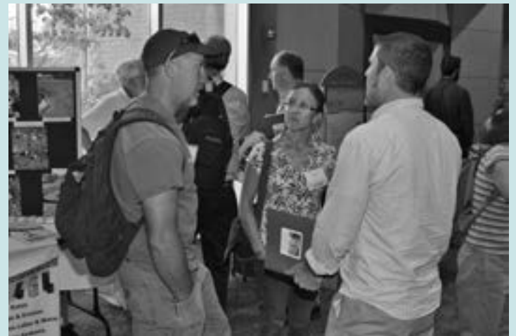
Catch up with colleagues...