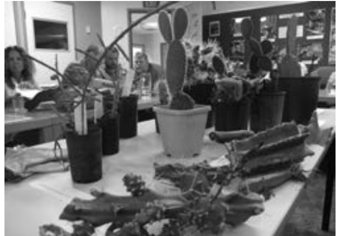
An invasive cactus identification training.

Finally, the Weed Spotters themselves include more than 1,000 individuals who have received training. They can be landholders, gardeners or members of community groups such as Landcare Queensland, Bushcare, Society for Growing Australian Plants, along with Australian, state and local government officers, industry representatives, and anyone else interested in weeds and plants. Many members are weed professionals who work with weed identification, management and control on a daily basis. Others encounter weeds while taking part