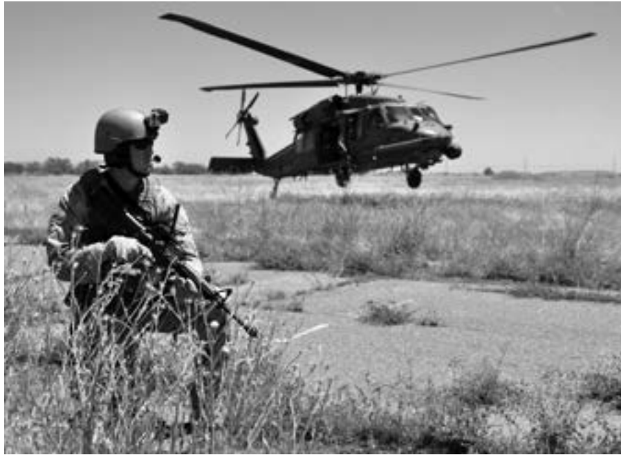
Yellow starthistle creates a safety hazard for aircraft by attracting birds near the runway at Beale Air Force Base in Yuba County.

brought in with military activities, the first detection of this grass in North America. Barbed goatgrass was found at