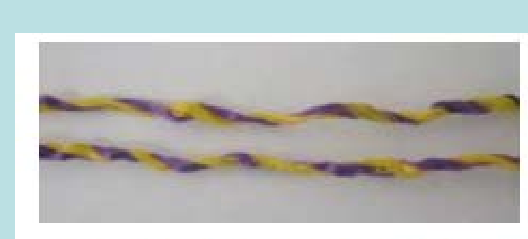
Purple and yellow twine used to certify bales and forges that meet the standards of the North American Weed Free Forage Certification Program

The only difference between the NAISMA and standard California WFF inspection protocol is the inspection for the additional species found on the NAISMA list and the requirement that bales be marked in the unique purple and yellow colored twine.