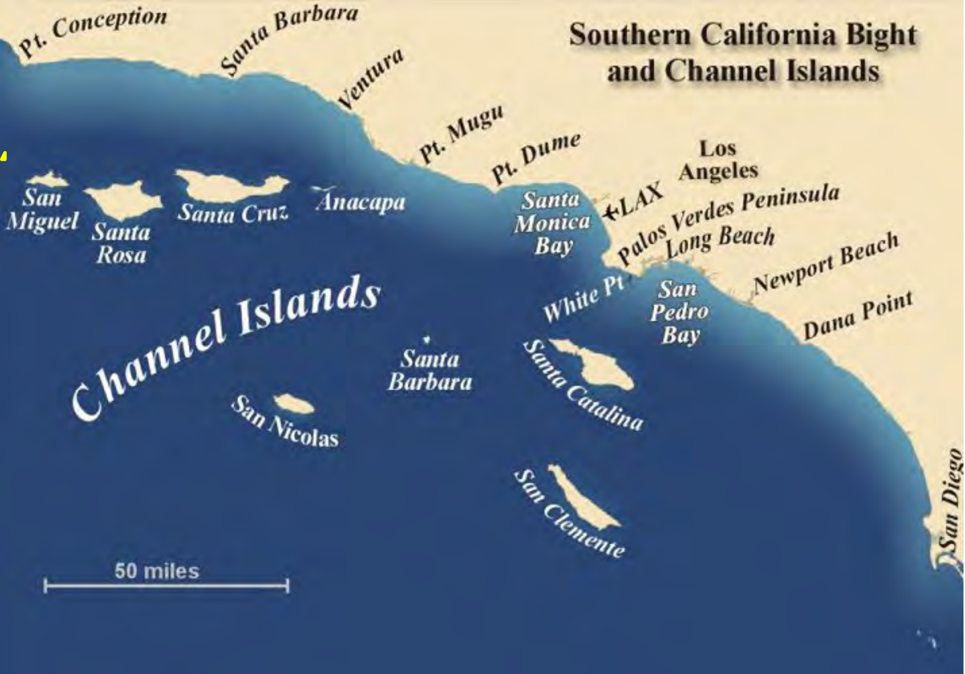
San Miguel Island is the 6 th largest Channel Island totaling 36.26 km 2 (14 mi 2 )