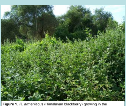
Figure 1. R. armeniacus (Himalayan blackberry) growing in the American River Parkway east of Sacramento, CA.

The research presented here is a preliminary study in which we identify firstgeneration hybrids of native Rubus with introduced Rubus in California. Future studies will assess the invasive potential of hybrids and the degree to which they have sexually recombined with the parent species. We ultimately hope to contribute to a broader understanding of the evolution and genetic basis of invasiveness in Rubus, so that invasive species may be more easily predicted and managed.