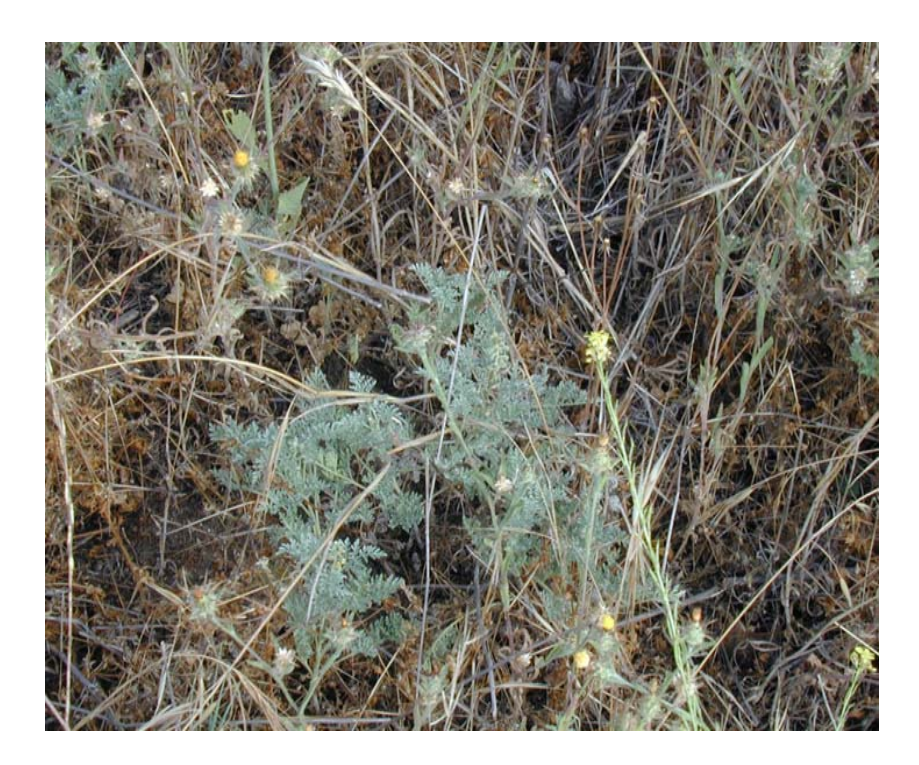
Weeds have died back in this photo, but density of load is evident. 2007 rains were sparse, but lateness favored natives. Imagine weed growth, density in a wet year with early rainfall.