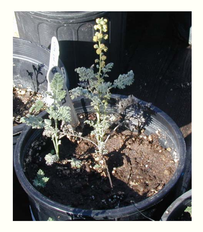
Blooming Ambrosia pumila used in Phase 1 of experiment. Picture taken 4 weeks after spraying.