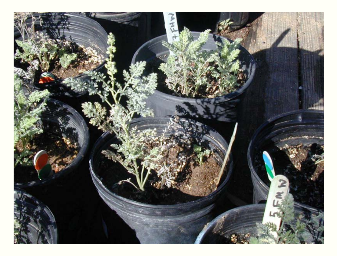
August 15, 2006 photo of potted A. pumila . Monitoring was done by 2 of the authors and 2 experienced weed workers.