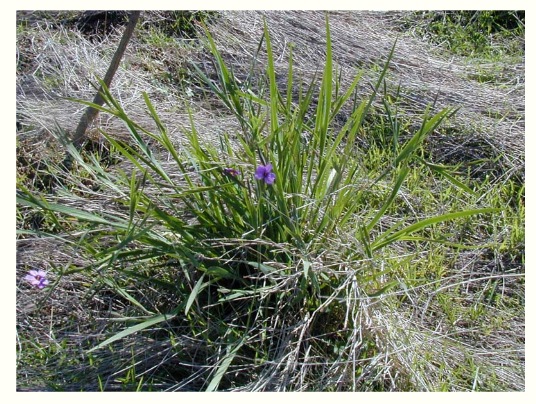
Healthy, unsprayed Sisyrinchium bellum (Blue-eyed grass), another bulb species common to native and mixed grasslands