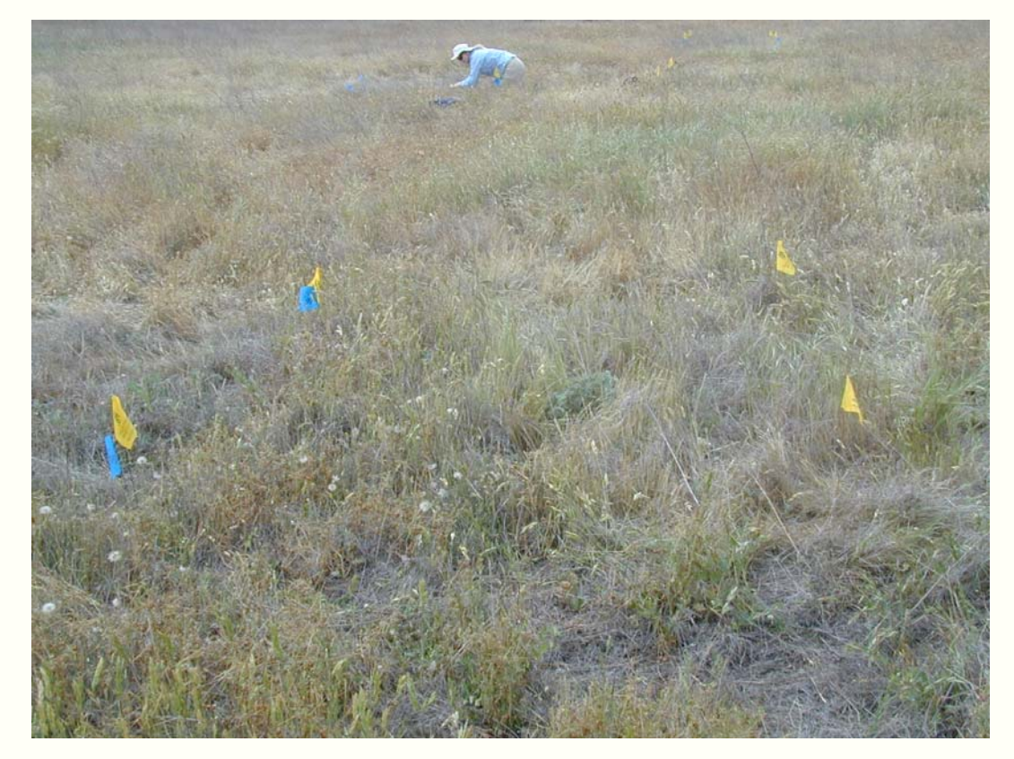
Flagged plots. Note common border of blue (spray plot) and yellow (control plot). Melanie Johnson Rocks, City of San Diego MSCP staff is in background