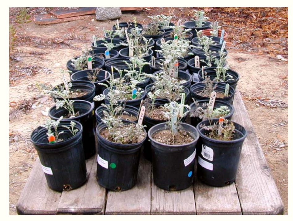
A. pumila plants ready for spraying.