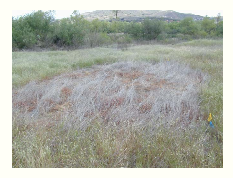
Note the height of the Avena fatua (wild oats) and Bromus spp.