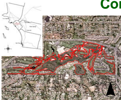
Figure 1. Coyote Hills East Preserve in Fullerton, CA. Inset is a regional map of the location of the Preserve.

Center for Natural Lands Management "Rise Early, Stay Late, and Take Care of the Land"