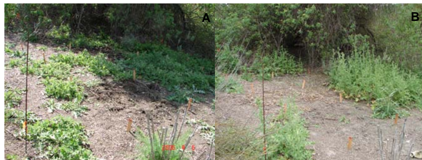
Figure 3. Comparison of treatments on April 6, 2006 (A), the day that hand-pull and herbicide quadrats were treated, and April 27, 2006 (B).