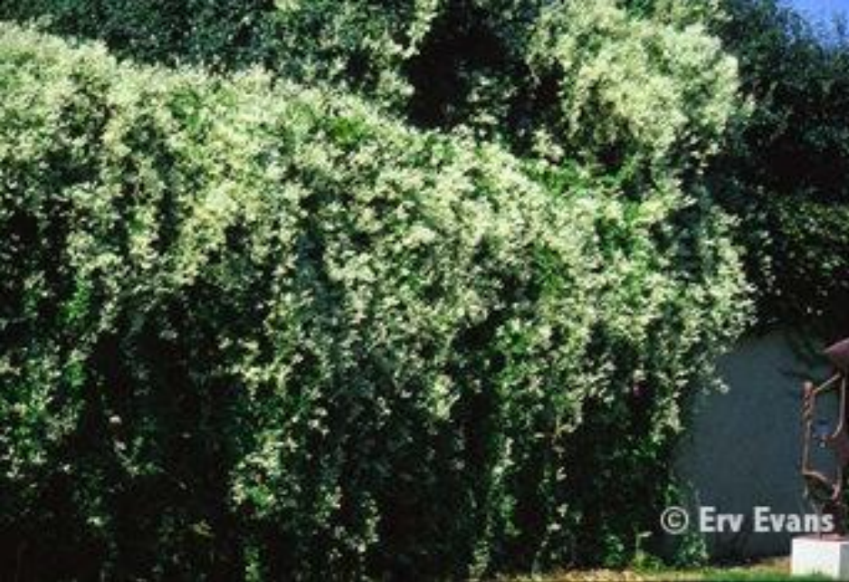
Polygonum aubertii (Chinese fleecyvine, silverlace vine)