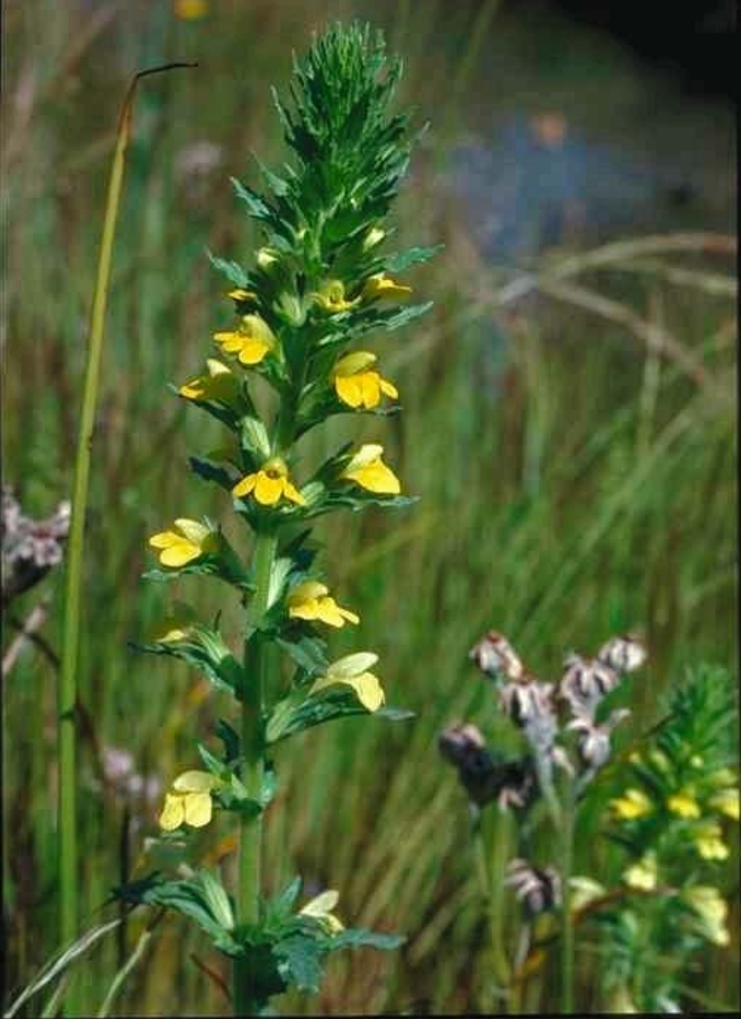
Parentucellia viscosa (yellow glandweed)