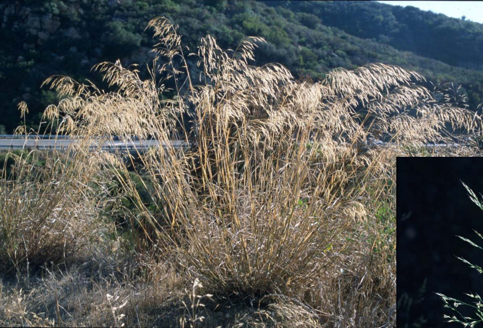
Piptatherum miliaceum (smilograss)