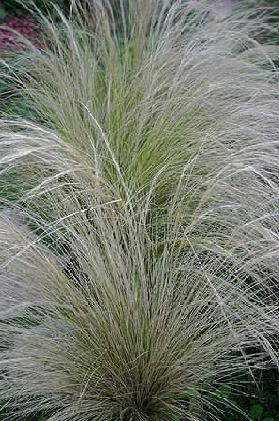
Nassella tenuissima ( Mexican feathergrass )