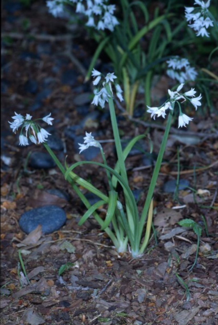
Allium triquetrum (tree-corner leek)