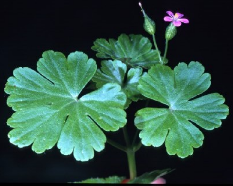
Geranium lucidum (shining geranium)