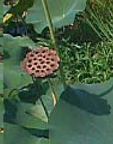
Nelumbo lutea (American lotus)