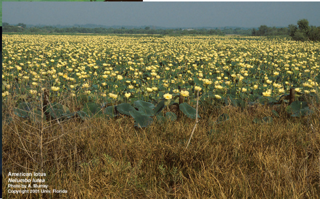
American lotus Nelumbo lutea