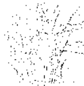
Arundo donax