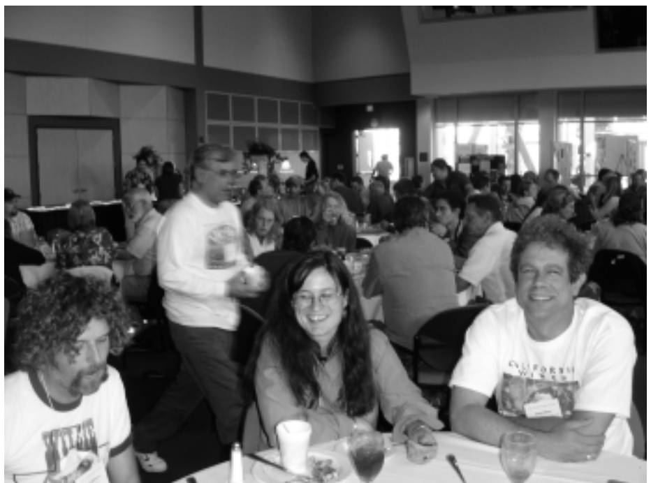
Weed workers at ease. October is a good time to take a break, and attendees at the 2005 Symposium found lots to talk about over lunch and between talks.

Pro bono graphic design - make our educational displays more attractive and effective.