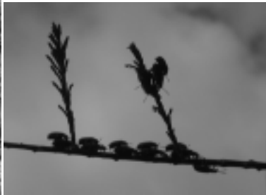
Diorhabda elongata, saltcedar biocontrol beetles, on tamarisk.