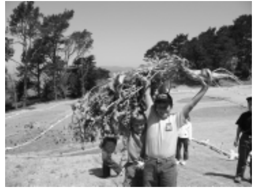
3rd Place Boy Scouts remove a humongous wild radish, Sunset Scrub restoration site, Presidio, San Francisco.