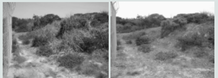
3rd Place Removal of jubatagrass in Manzanita Park. Sally Childs