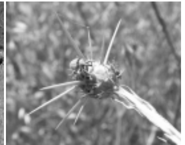
Hairy weevil for yellow starthistle control, St. Joseph's Hill Open Space Preserve.