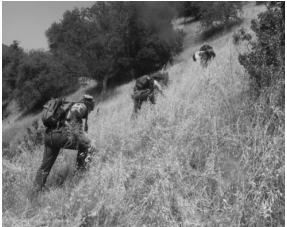
National Park Service crew removes yellow starthistle outliers at Yosemite NP.

Fast-moving and newly emergent invasive diseases deservedly get the most attention. Sudden oak death syndrome (caused by the fungus Phytophthora ramorum ) is a high-visibility problem that popped up in 1995 in California and kills healthy trees within four months (Kliejunas 2001). For nearly a decade, the fungus in the United States had been confined to Pacific states, but its chances of invading southeastern states, where numerous potentially susceptible oak ( Quercus ) species are ecological dominants, was learned to have been hastened in early 2004. At that time it was found that in spite of the best preventative efforts of APHIS, one large, infected nursery in Los Angeles had shipped