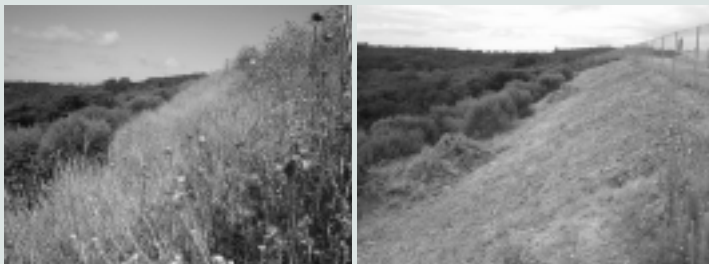
2nd Place A bank cleared of yellow starthistle. Sally Childs