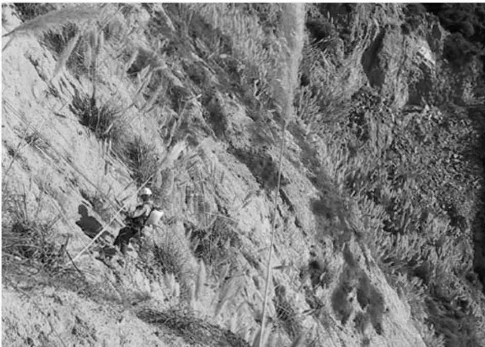
The NPS Exotic Plant Management Team removes pampas grass from difficult-to-access cliff faces, where plants can serve as significant seed sources.

The 1916 NPS Organic Act states clearly that the national parks are to be kept “unimpaired for the enjoyment of future generations.” The National Park Service now appears to be faced most ominously with massive impairment of the parks' natural resources by biological invasions from outside. One role for the National Park Service might be to accelerate its proactive role in informing its employees and the American public of the insidious nature of biological invasions. Another might be to include serious analyses of the importance of proactive quarantine systems suitable for regions at risk such as the Hawaiian Islands (see Reeser 2002). Major