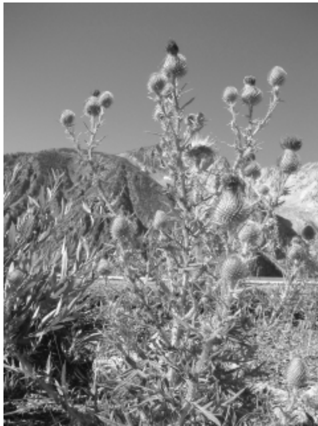
Bull thistle ( Cirsium vulgare ) invades Tioga Pass in Yosemite National Park. Many park units have been protected by their remoteness or elevation, but these barriers are being breached.

Other taxonomic groups besides vascular plants pose present and even greater future threats to park ecosystems. Insects and fungal diseases that attack trees are probably the most important groups nationwide. The Forest Service began working with the Animal and Plant Health Inspection Service (APHIS) of the U.S. Department of Agriculture (USDA) in the late 1980s to address invasive species threats associated with raw wood imports and solid-wood packaging materials (e.g. Tkacz et al. 1998). Nevertheless, Thomas Hofacker (staff entomologist, USDA Forest Service) sees forest health in the United States as broadly declining, with three to five new problematic insects or pathogens becoming established in this country each year, and with many tree species becoming