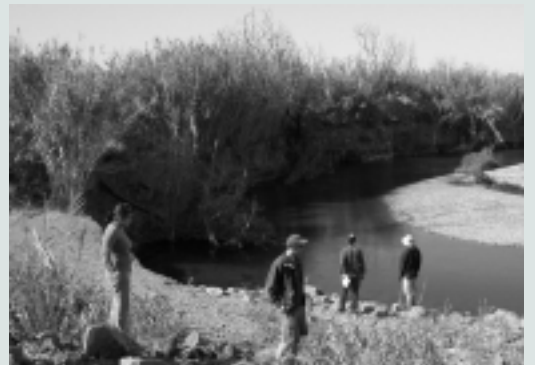
Left: The Bidwell Park field trip learns about the plantation of trees from around the world as engineering materials. Middle: At Sutter Buttes, participants visited a former ranch, full of yellow starthistle and medusahead, that State Parks recently acquired. Right top: "Sacramento River As It Was" examines a vernal pool. Right bottom: Giant reed dwarfs Cal-IPC members on the "Arundo and Tamarisk in the North" trip.