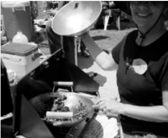
Wok as control tool. Preserve Calavera serves up some weeds.