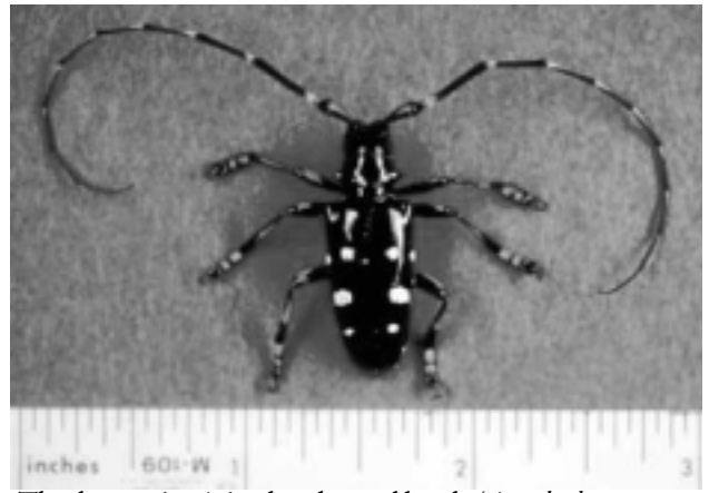
The destructive Asian longhorned beetle ( Anoplophora glabripennis ) from China provided a wake-up call regarding the threat of solid-wood packaging material as a major pathway for invasive pests into the United States. After being intercepted repeatedly at ports of entry for several years by border protection quarantine officials, a population was discovered in Chicago in 1998.

Oceanic islands are well known to be especially vulnerable to invasive species. The Hawaiian Islands comprise one of the most isolated island groups in the world, with