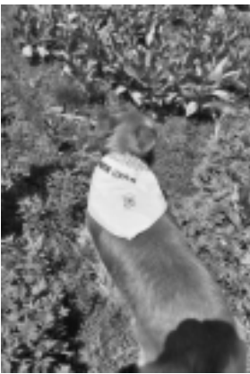
Canine "Woad Warrior," Klamath National Forest.