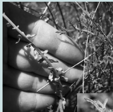
Seed pods and leaves.

weed, as it is called in Australia, additionally is considered a highly flammable species (Friends of the Whyalla Conservation Park) and has a very dense cover in the Carlsbad location. It is also considered a serious