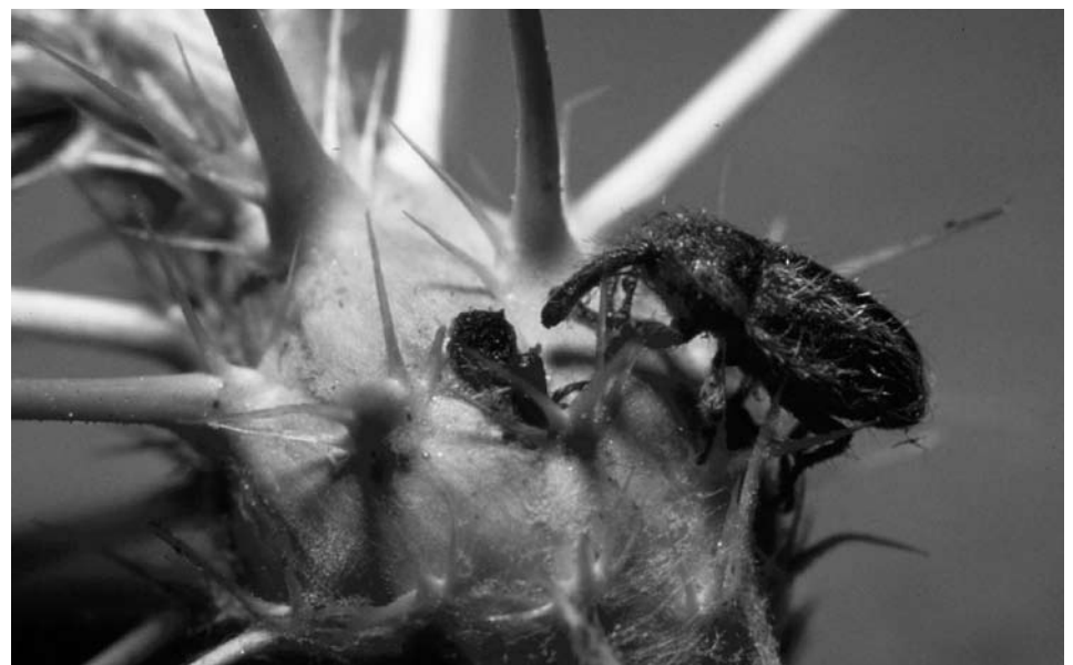
A thing of beauty. Eustenopus villosus , the yellow starthistle hairy weevil, is reducing seed production across California.

These are heady days for biocontrol agents, and their potential to make a significant impact on our work should be acknowledged and supported. Diorhabda beetles appear to be a major biocontrol success story, addressing perhaps the most widely known weed in the western US. New yellow starthistle agents are in the pipeline, and permit applications for two Cape-ivy agents are in the final stages of preparation. We hope our feature article demystifies the topic and gives you a better idea of what is on the horizon for biocontrols.