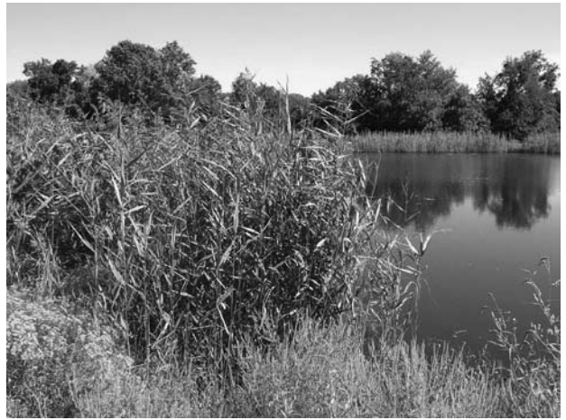
Non-native Phragmites australis population surrounding a pond in Connecticut.

Chemical control efforts for this plant have been ongoing for years around the Salton Sea, a region where both native and invasive genotypes are present. However, these control efforts can impact non-target plants (Kay 1995), including native P. australis populations (A. Lambert, personal obs.). In Utah and Colorado, invasive populations have increased substantially in recent decades, with many subsequent control