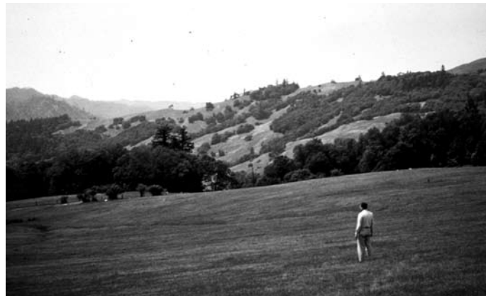
A field in Mendocino County before and after biocontrol by Chrysolina quadrigemina . At top, from 1948, the foreground is filled with Klamath weed. By 1950, range grass had replaced Klamath weed. The lower photo, from 1966, shows sustained control of Klamath weed.

tack it. This was enough to tip the ecological balance in favor of the weed, especially in heavily grazed grasslands.