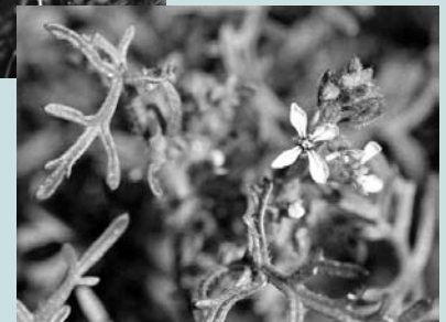
Flowers and leaves. Photo by David Scott.

threat in Australia to one or more vegetation formations (The Nature Conservancy).