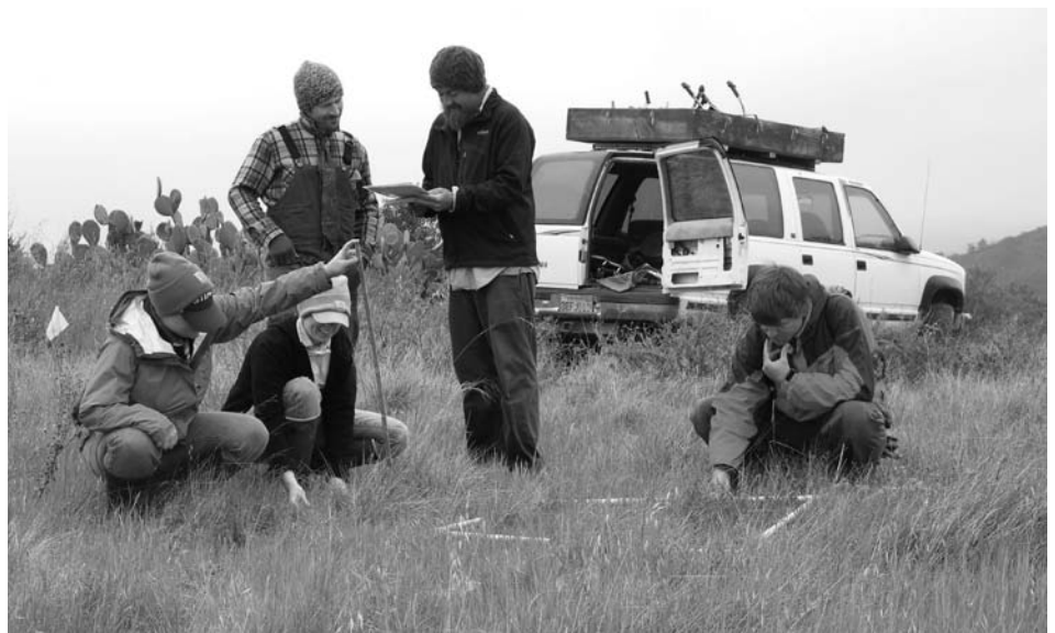
Audubon Starr Ranch is taking climate change into account while planning and monitoring restoration projects.

One of the principles of climate-smart planning is to build in redundancy—multiple seed sources, increased size and connectedness of preserved or treated areas, high ecological and species diversity, etc. Similarly, when a project or plan is designed, alternatives should be judged for their potential success under multiple future scenarios, and the best choice is the project that has the most success across scenarios, not the project that performs the best under just one likely scenario. Nat Seavy of Point Blue Conservation