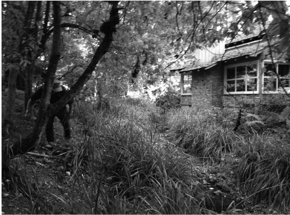
A section of Old Mill Creek before Carex pendula was removed from the streambanks.

The only money we spent on this project was $1,875 for native plants: about 35 lady ferns, 60 chain ferns, 60 Juncus patens rushes, grasses, and two flowering