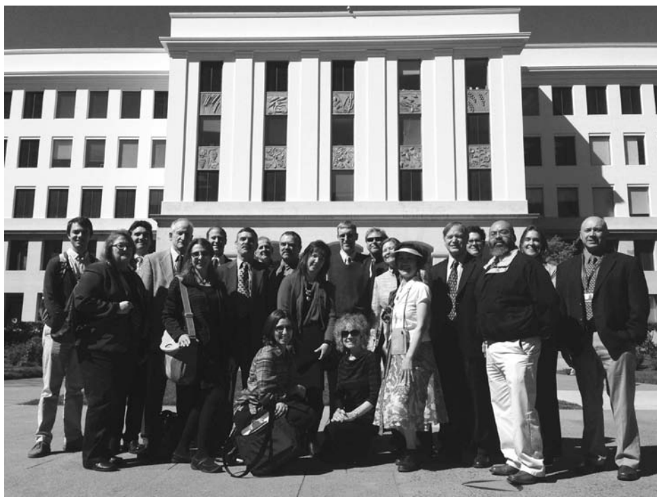
Invasive Weeds Awareness Day at the Capitol attendees before capitol visits, March 12.

We will keep you posted on progress as the legislative session and the budget continue to unfold. We are monitoring possible water bonds for this fall, and a possible park bond for next year, both of which could contain funds for on-the-ground restoration work.