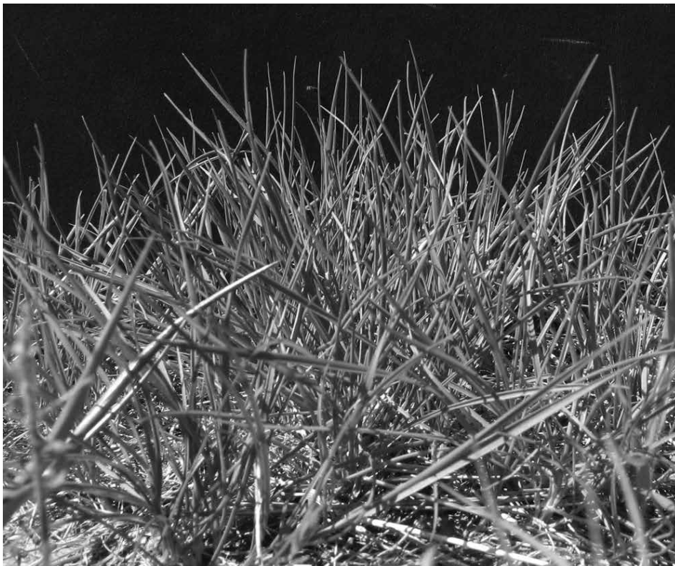
Medusahead at the proper phenological stage to begin a targeted grazing treatment.