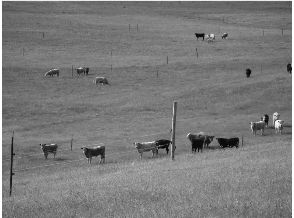
Fenced cattle in medusahead timed grazing research trial.