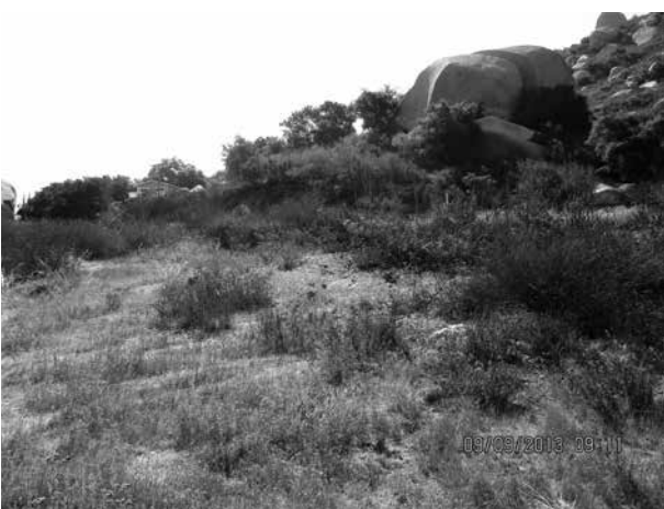
State Route 67, Post Mile 17.4, north side, before broom removal (March 2012) and after removal (September 2013).