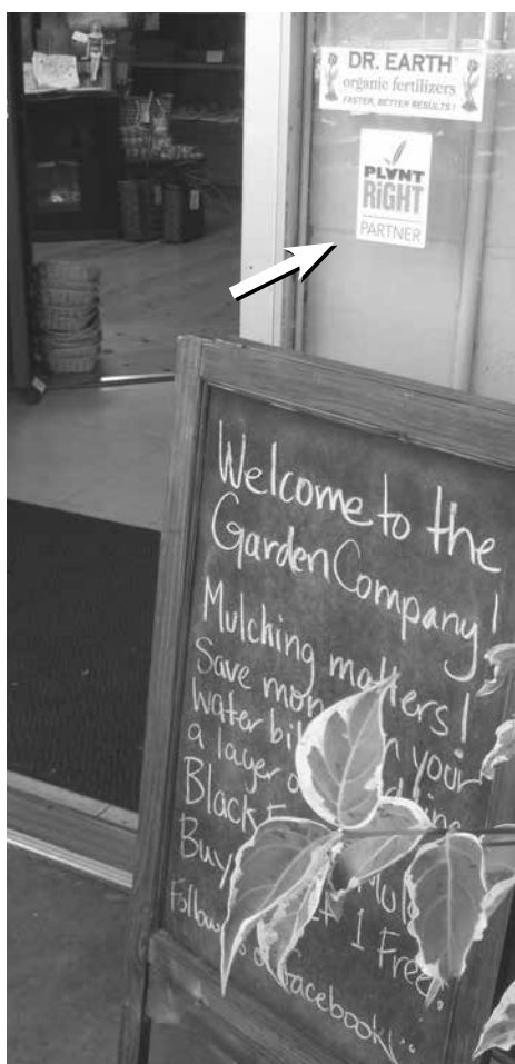
The Garden Company in Santa Cruz proudly displays its PlantRight window decal.

"PlantRight training allows us to make responsible purchasing choices, share our philosophy with customers, and offer reasonable alternatives to popular invasive species. I would encourage all garden center owners and managers to participate in this partnership."