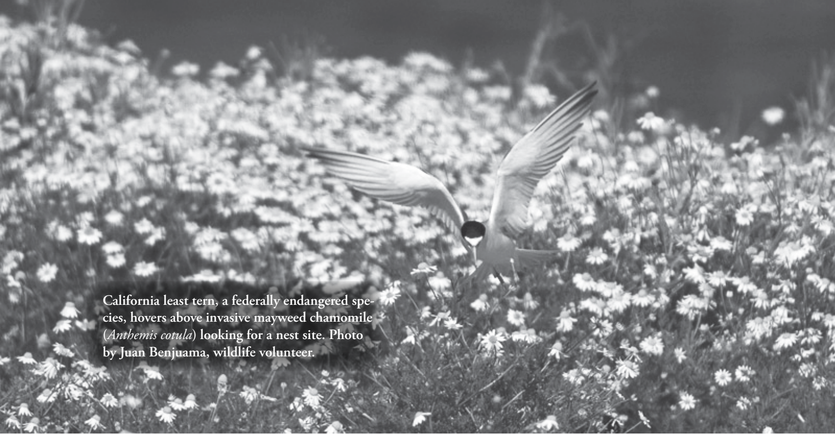
California least tern, a federally endangered species, hovers above invasive mayweed chamomile ( Anthemis cotula) looking for a nest site.