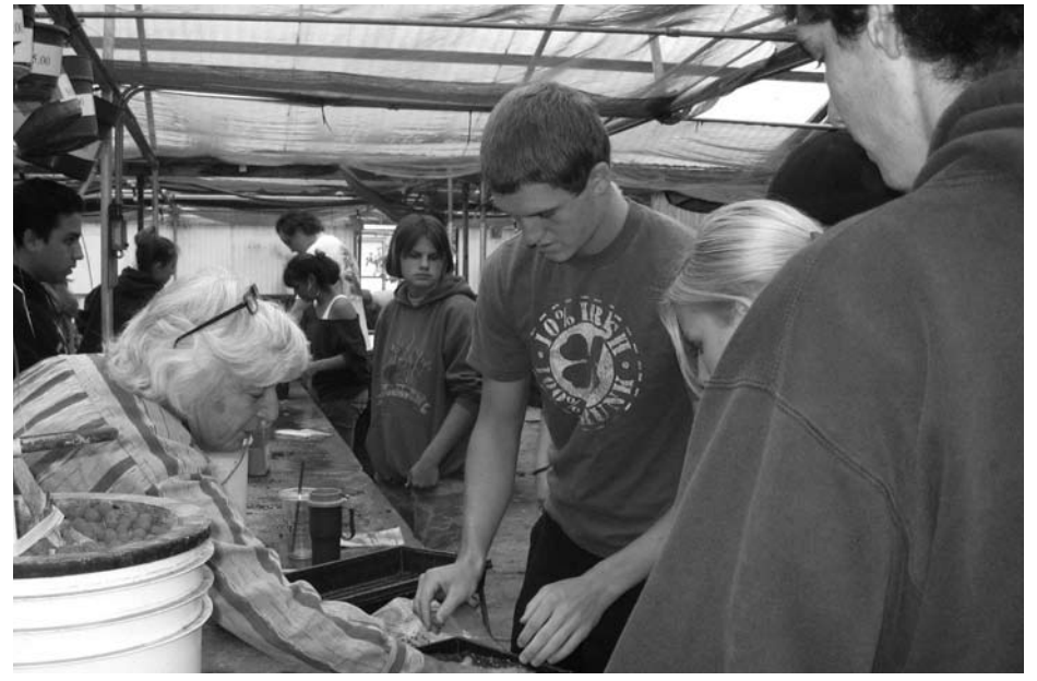
Chico High School students cultivate native plants for Bidwell Park.