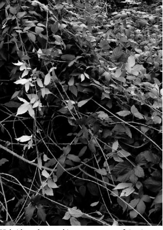
Hybrid raspberry taking over an area of riparian forest of Putah Creek west of Winters in February 2005.