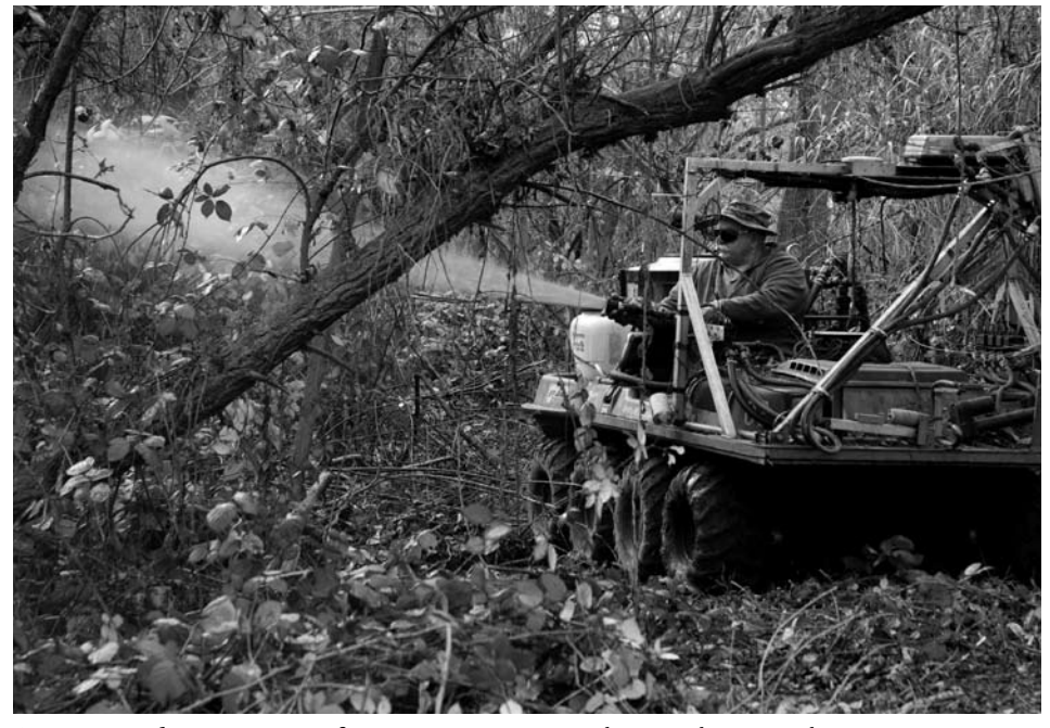
Spraying Rubus armeniacus from an Argo sprayer.