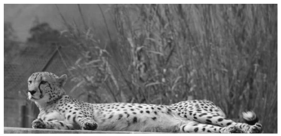
A cheetah lounges in front of some giant reed ( Arundo donax ) at Cheetah Outreach in Spier, South Africa.

riverbank formerly covered in Sesbania punicea (red sesbania) had hardly a plant to be seen thanks to a suite of biocontrol agents, including a bud-feeding weevil ( Trichapion lativentre ); a seed-feeding weevil ( Rhyssomatus marginatus ); and a stem-boring weevil