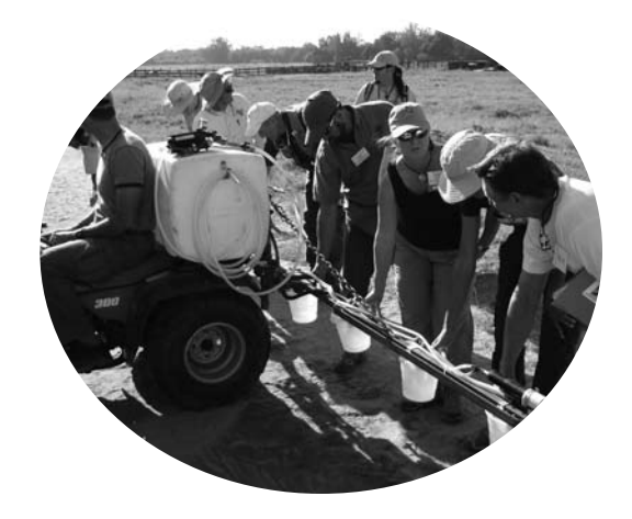
Attendees at the Herbicide Control Methods Field Course learn how to calibrate chemical application rates (water was used for the demonstration).