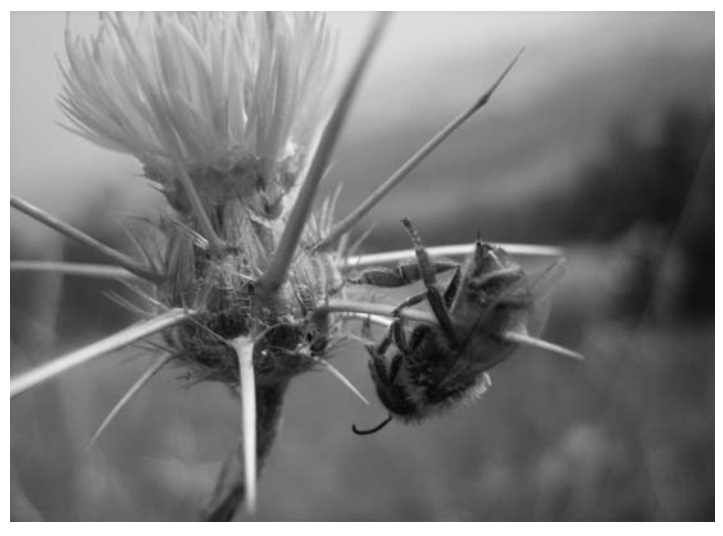
Above: We knew yellow starthistle was bad but who knew it could be deadly? "Big Bad Thistle. Mount Diablo State Park, Contra Costa County." Photo: Cyndy Shafer, 2009 Photo Contest.

Photo Contest: "If Only Crack Killed Weeds" By Alicia Medina, submitted by Lana Meade of Año Nuevo State Reserve.