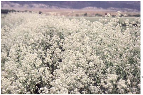
A tall whitetop infestation.

MULTI-YEAR TREATMENT: Most methods of treating tall whitetop re-